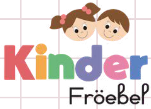
COLEGIO KINDER FROEBEL