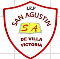
COLEGIO SAN AGUSTIN