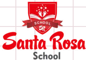
SANTA ROSA SCHOOL