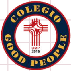
COLEGIO GOOD PEOPLE