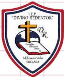
COLEGIO DIVINO REDENTOR