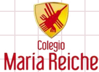
COLEGIO MARIA REICHE