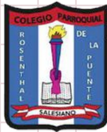
COLEGIO SALESIANO DE MAGDALENA