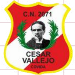
COLEGIO CESAR VALLEJO