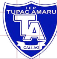
COLEGIO TUPAC AMARU