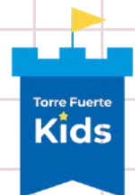
COLEGIO TORRE FUERTE KIDS