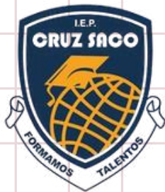
IEP CRUZ SACO