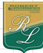
COLEGIO ROBERT LETOURNEAU