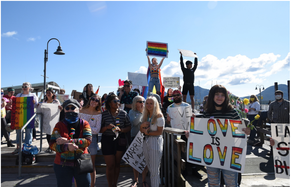
(above and right) Photos from the LGBTQIA+ Protest on June 5, 2020 outside a local florist who denied service for a same sex wedding

The passing of Ketchikan's non-discrimination ordinance is a direct example of our collective power to enact policies that protect us. By showing up and advocating for our rights, we effected lasting change in our community. We have every right to take up space, to make our experiences visible and voices heard. We are valued members of this community. We belong here.