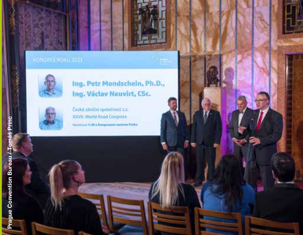
Prague Convention Bureau / Tomáš Princ