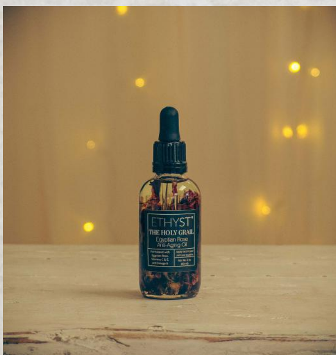
Best Selling Holy Grail