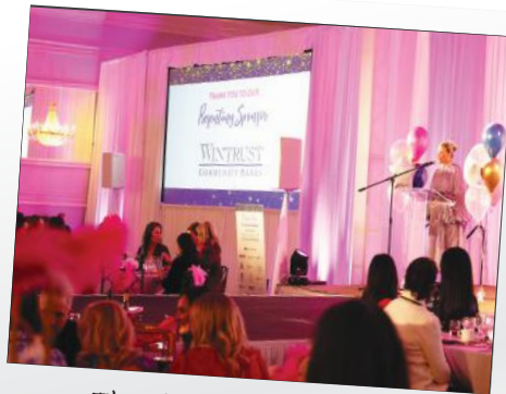
Thank you, Wintrust Community Banks

Many thanks to Endeavor Health for their generous grant supporting our Transitional Housing Program. Your investment in our community makes an incredible difference!