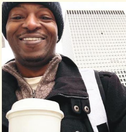
Clients' names changed to initials to protect their privacy.