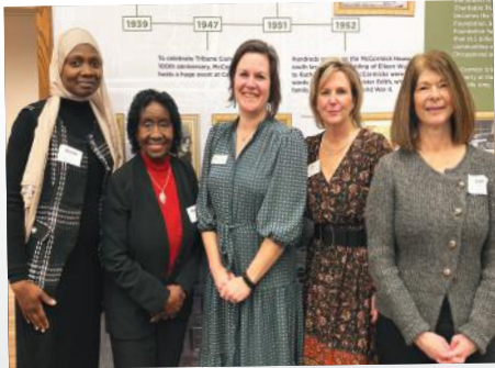
Thank you, Robert R. McCormick Foundation & the Daily Herald

Our friends in the community make a world of difference to the families we are honored to serve. Thank you for your support of Bridge families!