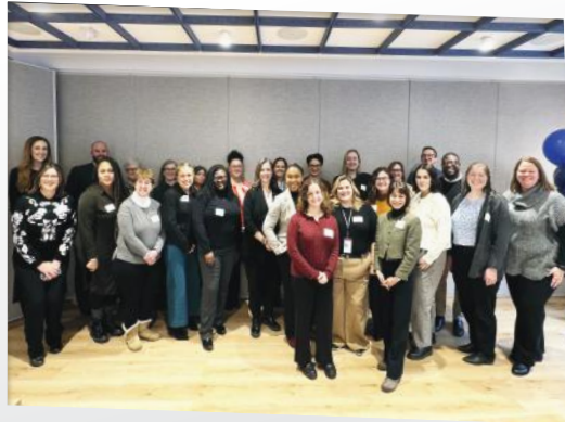
Thank you, Insurance Industry Charitable Foundation (IICF)

As part of the Neighbors in Need Fund, the Daily Herald featured Bridge in an article that helped raise funds for our mission that were then matched by the Robert R. McCormick Foundation.