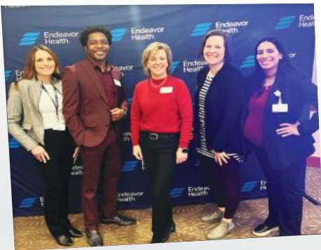
Thank you, Endeavor Health

We are so grateful for IICF's dedicated support of our mission. Their continued partnership makes a transformational difference for the families we serve.