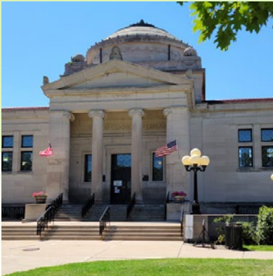
Simmons Library 711 59th Place Kenosha, WI 53140