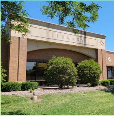
Southwest Library 7979 38th Avenue Kenosha, WI 53142