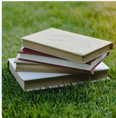
General Information 262-564-6100 www.mykpl.info