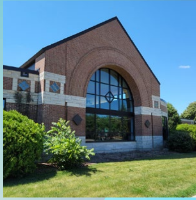
Northside Library 1500 27th Avenue Kenosha, WI 53140