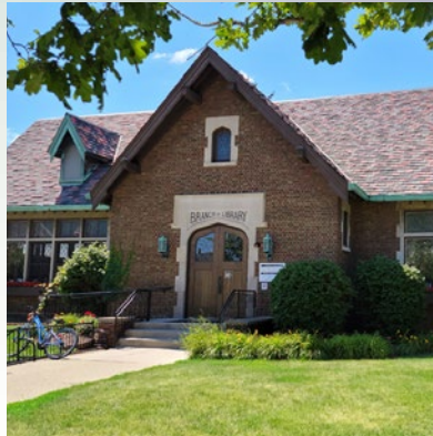
Uptown Library 2419 63rd Street Kenosha, WI 53143