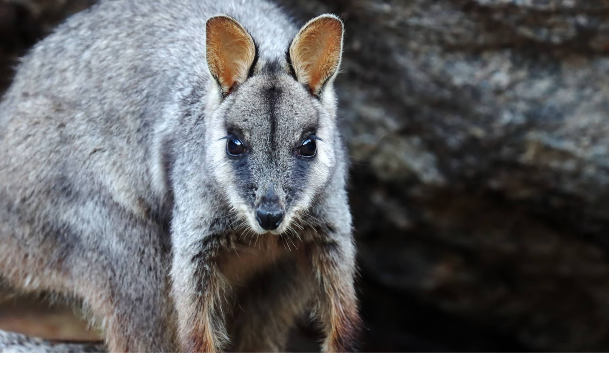
I suppose I'll have to be a grown-up now.