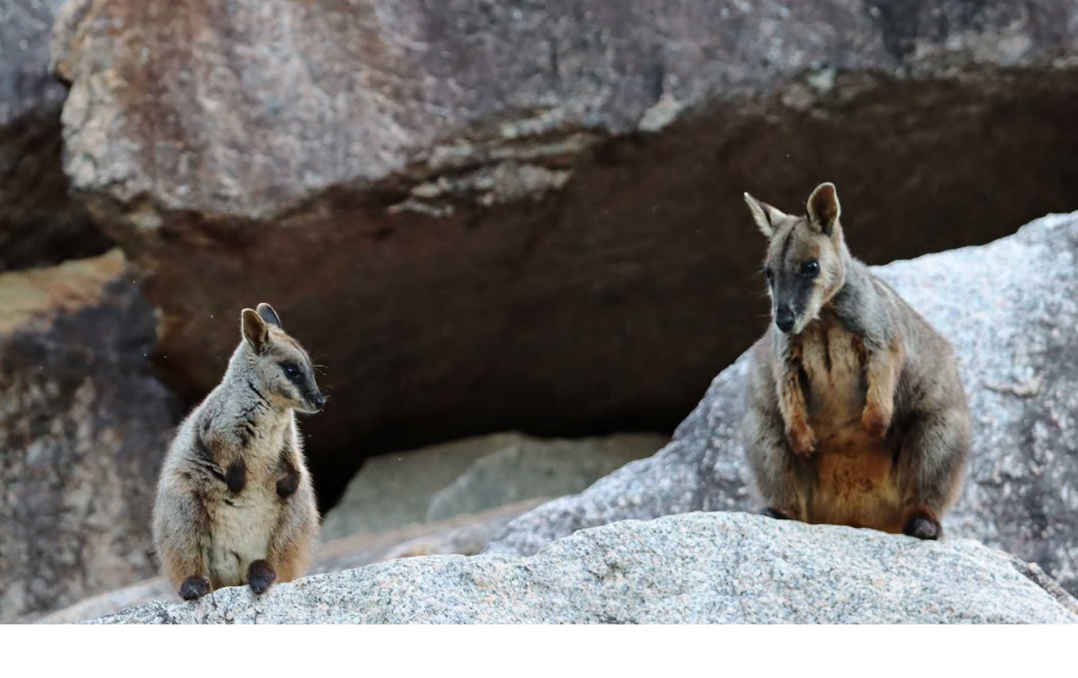
Mum, are you sure I don't fit into your pouch anymore?