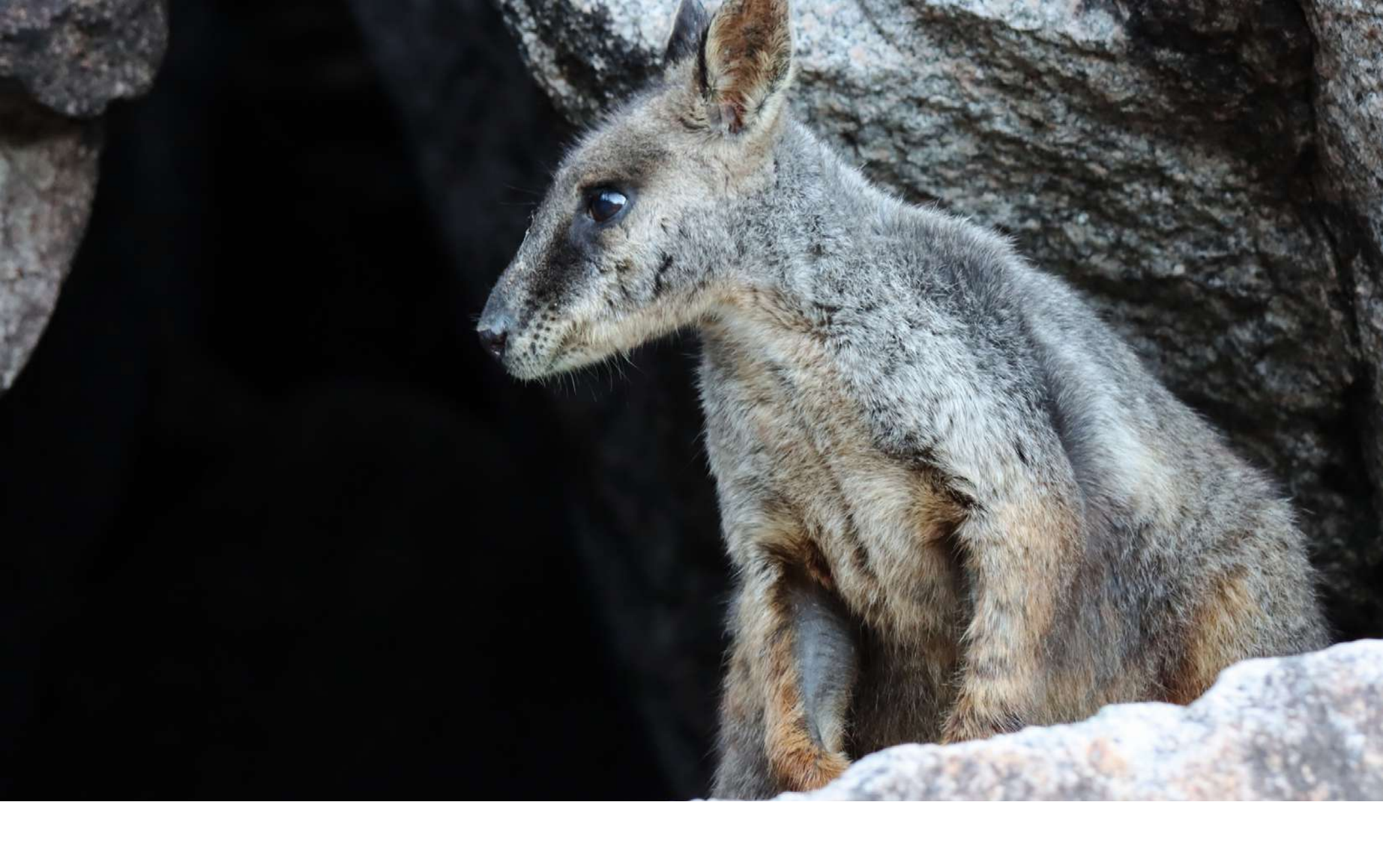
This cave doesn't look as inviting as Mum's pouch if you ask me.