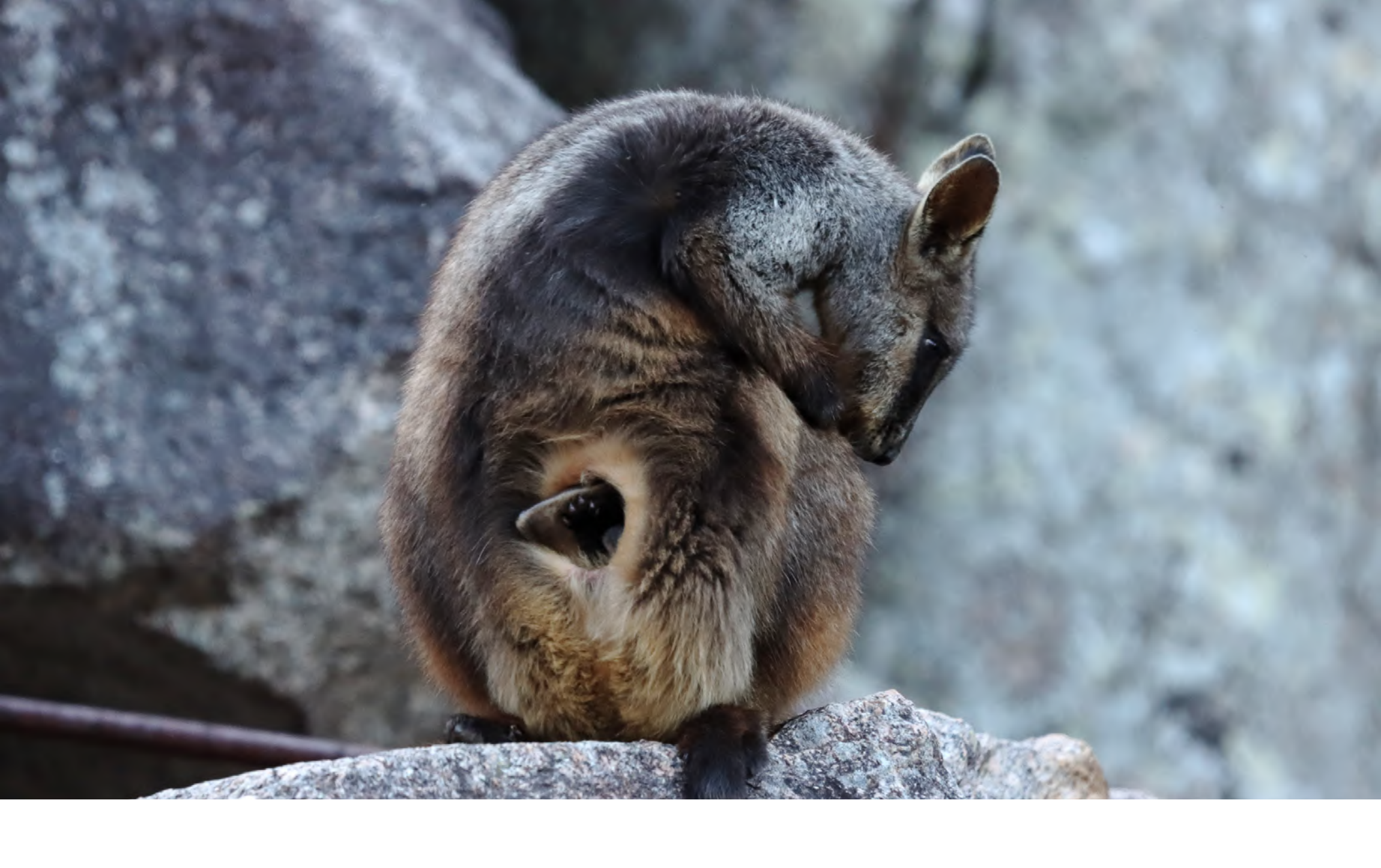
There's lots of room.