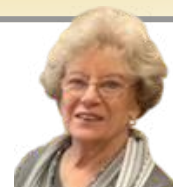
PARLIAMENTARIAN SUZI CABE