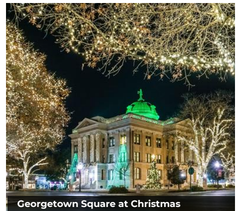
Georgetown Square at Christmas