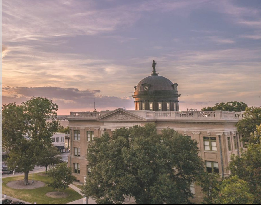
Georgetown City Hall

Georgetown offers a fantastic opportunity for residents to savor a leisurely stroll along the picturesque San Gabriel River or indulge in a game of golf at one of its five local courses. For avid mountain bikers, the trails around Lake Georgetown beckon, guiding riders to the scenic fringes of the renowned Texas Hill Country. Additionally, the city's annual food and arts festivals, a plethora of independently owned restaurants, thrilling rodeo events, nearby wineries, and charming Victorian commercial architecture ensure that residents have a wealth of enticing attractions to explore right in their own backyard.