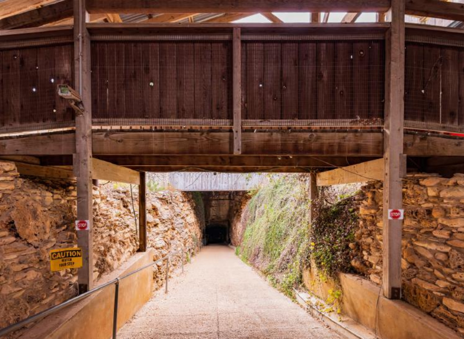
Inner Space Cavern