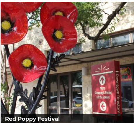
Red Poppy Festival

For more events information please visit visit.georgetown.org