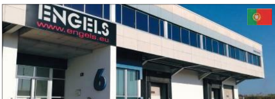
Engels Logística e Ambiente Unip