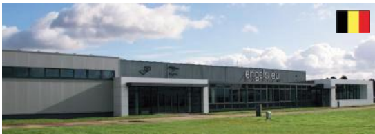
Engels Logistics NV