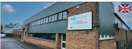
Engels Protechnic Ltd.