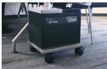
Often ecomodules are used in offices.