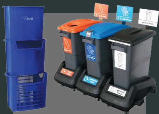
More-fraction waste receptacles