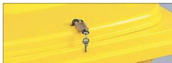
Various locks for secure locking of the container.

Standard 2-wheel and 4-wheel containers are available in 5 (and often more) colours directly from stock. For colour combinations and accessories such as special lids, we require between one and two weeks' delivery time due to assembly.