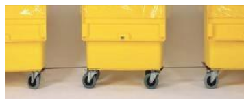
Coupling system to facilitate transport of containers.