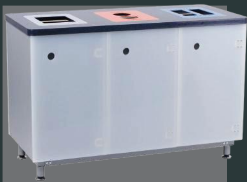
Develop your own waste management facility