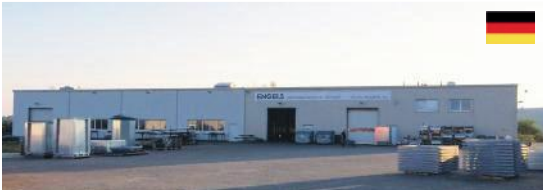
Engels Behältertechnik GmbH