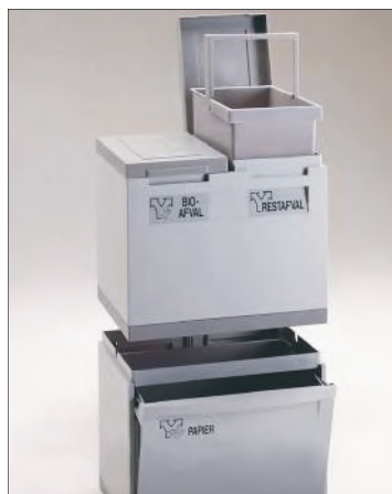
Our modular waste seperating system.