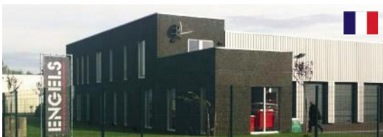
Engels Manutention & Environnement SARL