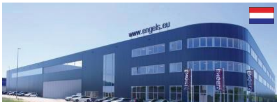
Engels Logistiek B.V. - Engels Group NV