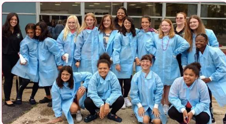
Phi Rhos from the Xi (Rutgers) chapter helped out at Dream Day Princeton in 2018. They served as group leaders for the participants.

The Foundation is extremely excited to announce the development of the DreamGirls Program in partnership with the DreamGirls Initiative and the accompanying grant fund. The DreamGirls Initiative is committed to exposing middle school girls to different STEM careers through their participation in the events they offer. It has been shown that there is a 70% increase in STEM interest after attending a Dream Day event. We encourage you to take advantage of this opportunity to play a part in developing the next generation of women with STEM careers. Details and instruction packets on the program types can be found in the Documents section of the Phi Rho Portal! Donations can also be made through the Phi Sigma Rho Foundation website to provide chapters and alumnae the resources and support needed to have these events.