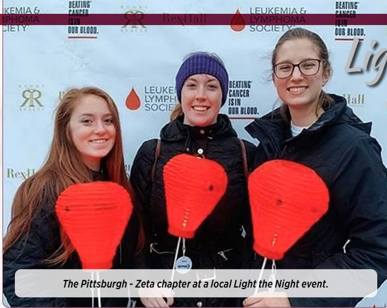
The Pittsburgh - Zeta chapter at a local Light the Night event.