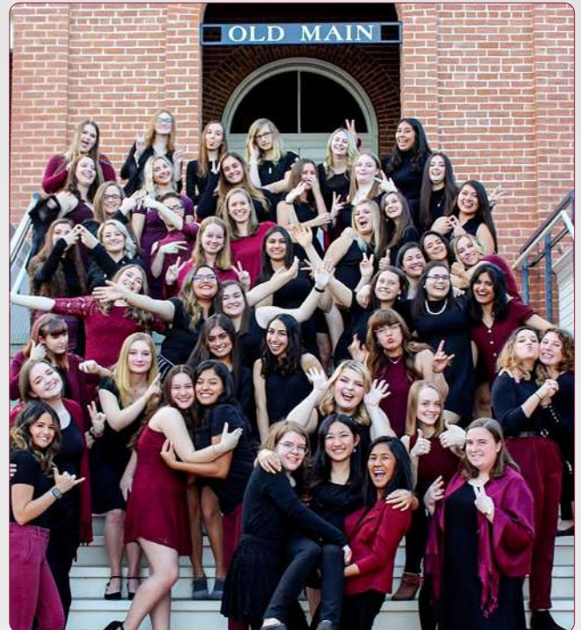
Alpha Kappa Chapter, University of Arizona

To start off the semester, we ran a very successful virtual recruitment where we welcomed our Epsilon class. We just held Big/Little reveal and are very excited to welcome them into our families! We also held our first virtual fundraiser for the LLS which was a concert and comedy show that raised over $500! Lastly, we have had two of our members serve on National Committees and are excited to have more involvement in the future.