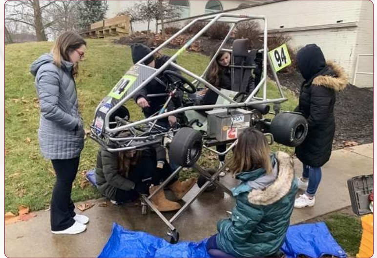
Below & to the Right: Photos are from the Purdue - Alpha chapter during the annual Purdue Grand Prix

Although Phi Sigma Rho Conference 2020 looked a little different, the Phi Sigma Rho Foundation was still able to participate in various ways and recognize the accomplishments of 2019-2020. There were many exciting announcements to make including the development of two new grant programs, the launch of our partnership with the DreamGirls Initiative, and the awarding of SIX $1,000 scholarships to exceptional and deserving sisters continuing their education. In addition, we were able to recognize the success of five years of the Light the Night Program and honor our donors who help make all of this possible. Read more about our conference recap below!