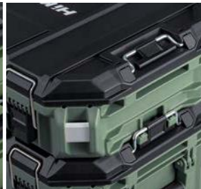
Quick Secure Stacking Latches

Creates a water tight seal against dust, soil, water and rain