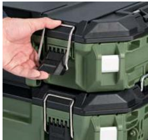
Heavy-duty Large Latch System

Durable construction designed to protect contents against harsh elements