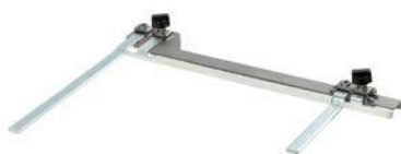
380742 Guide Rail Adaptor Optional Accessory