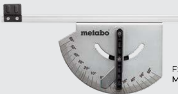
FSW Mitre Fence

Metabo rail saw accessories are compatible with HiKOKI C3606DPA Plunge Cut Saw