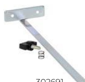
302691 Guide Optional Accessory