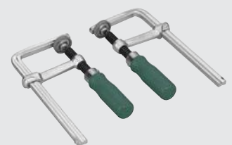
631031000 Tension Clamp (2pk)