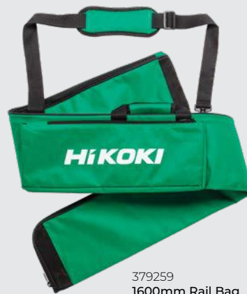
379259 1600mm Rail Bag