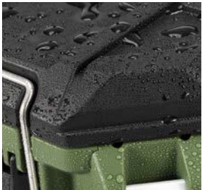
IP65 Water & Dust Protection

MULTI CRUISER is an interlocking modular storage system that's versatile, customisable and makes transporting of tools easy. MULTI CRUISER is constructed from rugged impact resistant material to withstand harsh environments and provide added tool protection. MULTI CRUISER offers a range of inner trays, cases, and accessories to support a wide range of configurations.