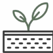
Soil Health Monitoring