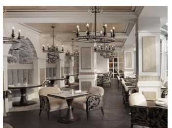
Accommodations subject to change. 20