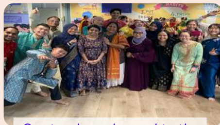
Our teachers dressed to the nines in vibrant Indian ethnic outfits to celebrate the occasion!