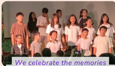
We celebrate the memories we've cultivated over the years by singing with fervour.