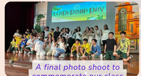
A final photo shoot to commemorate our class camaraderie.