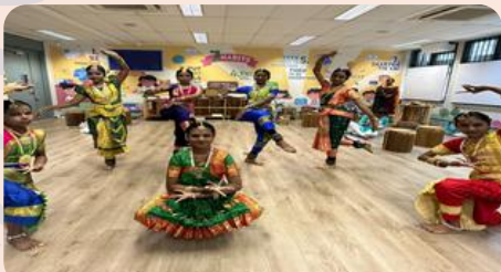
Ready, set, vogue! Say cheese and strike a pose for the camera!

Recess was a total hit with hands-on fun such as murukku-making, henna tattooing, and the classic Indian game of Pallangkuli . Our pupils were treated to a visual feast with a splendid display of various Indian costumes, while the P6 dance and drama stole the show! The talented P6 pupils choreographed a breathtaking performance about the birth of Deepavali, and even our teachers put on their dancing shoes for an epic finale. It was a festive celebration like no other!