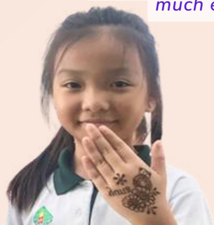
Wow! This henna tattoo's a stunner!