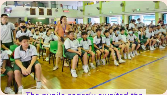
The pupils eagerly awaited the announcement of their results.

195 candidates sat for the PSLE this year. 100% of the candidates who offered standard subjects qualified for secondary school with 58.5% eligible for posting through Posting Group 3. While 24 pupils attained a total score of AL12 and below, 3 pupils topped the foundation cohort. 37 pupils received postings to secondary schools via Direct School Admission.