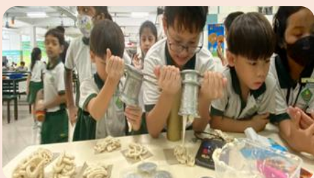
No doubt about it, chomping on murukku is way simpler than making them!