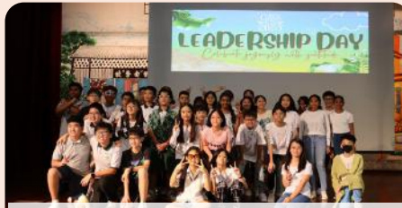
The best moments to remember!

The P6 Leadership Day marks the end of primary school for P6 pupils. Planning for the event began after the conclusion of the PSLE exams. The day celebrated the pupils' talents through musical performances, and each class put on an outstanding show. Parents wrote notes to encourage their children, and the day was emotional as pupils came to terms with leaving primary school. The day ended with tears, hugs, and expressions of gratitude towards teachers and parents, leaving pupils with lasting memories.