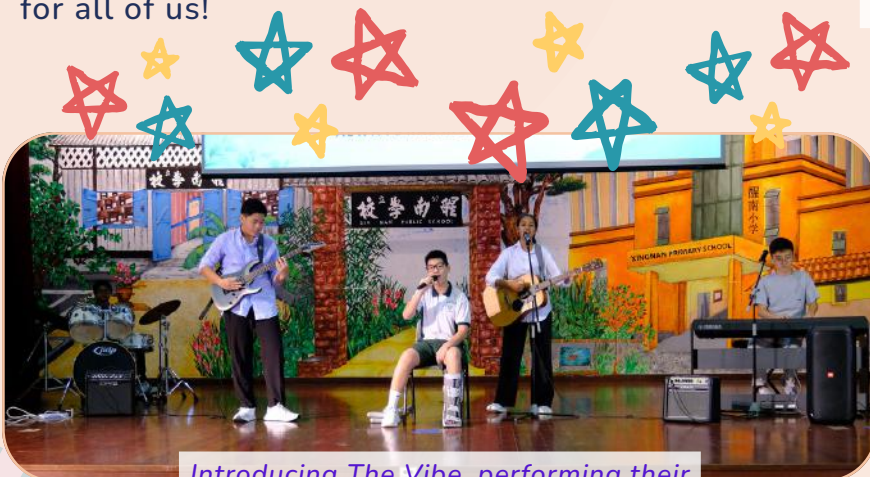
Introducing The Vibe, performing their interpretation of "High Hopes".