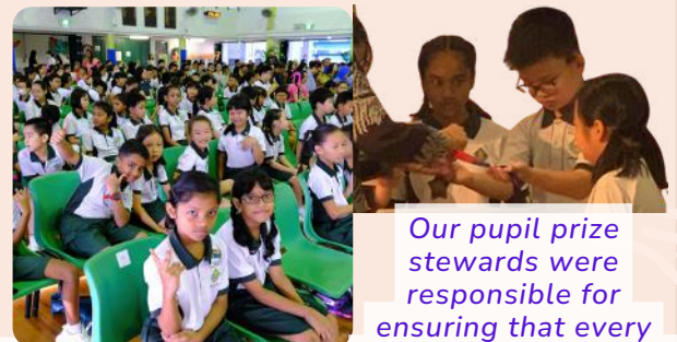
Our prize recipients are thrilled to receive their awards. Our pupil prize stewards were responsible for ensuring that every recipient received the appropriate medal and certificate.