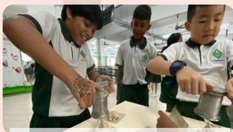
Who knew that cooking up this yummy snack required so much effort!