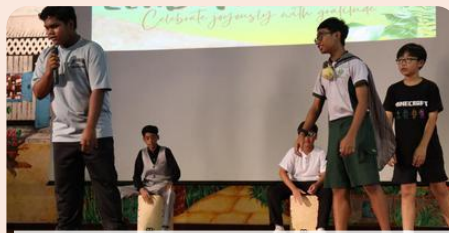
This is our final shot to shine, so let's unleash all our talent and rock the stage like never before!