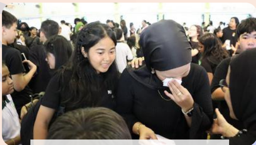
Parting ways can be difficult.