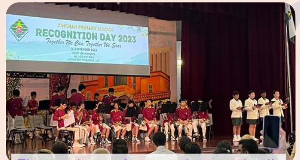
The opening performance by our school's brass band was introduced by our emcees.