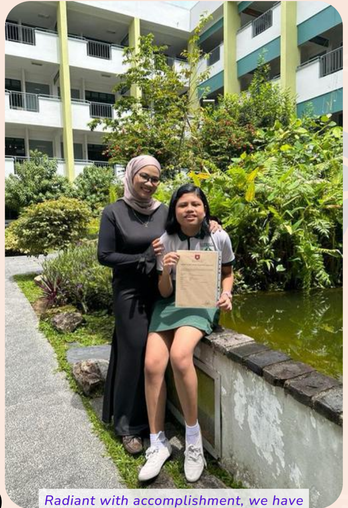
Radiant with accomplishment, we have reached our destination!