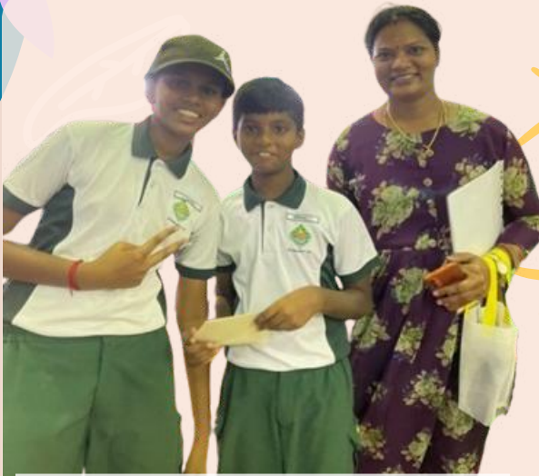
We now understand the true essence of reaping the rewards of our hard work.

Heartiest congratulations to the class of 2023 on their achievements! Their hard work and sheer determination have paid off.