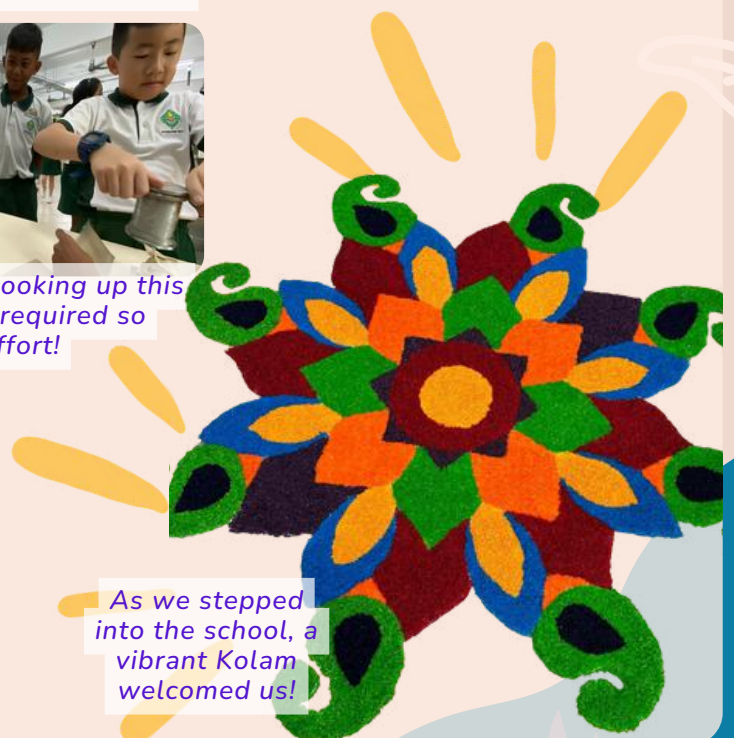
As we stepped into the school, a vibrant Kolam welcomed us!