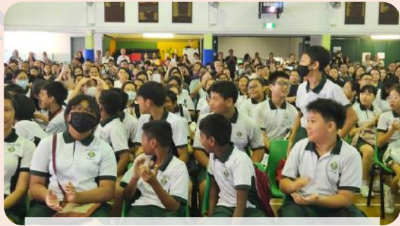
The pupils fervently applauded their peers for their excellent performance in the examinations.

We affirm the efforts of our pupils and encourage them to look forward to the next phase of their educational journey. We thank the parents for their unstinting support in their children's learning all these years. We appreciate our teachers for their dedication and diligent efforts in guiding our pupils and bringing out the best in them.