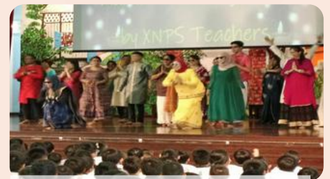
Our teachers brought down the house with their sleek dance moves!