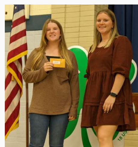
Gold Guard Award