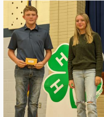
Silver Guard Award