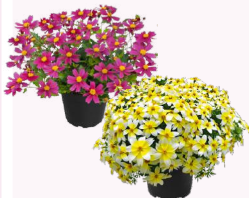
Bidens Bee Series