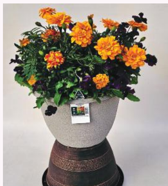
D10.5 Classical Planter Tile Planter Warm Copper Changing to 11" Bombay Planter Vintage Rust

Old D10.5" Classical On Bottom. New On Top