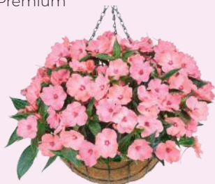
New Guinea Impatiens Harmony Colorfall Flamingo

Other colors offered in P6.3 AAC Premium