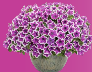
Petunia of the Year: Supertunia® Hoopla® Vivid Orchid