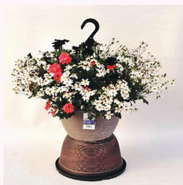
H12.5 Combo & Specialty Begonia Helix Warm Copper Changing to 13" Bombay HB in Powdered Taupe

Old 12.5" HB Combo On Bottom. New On Top