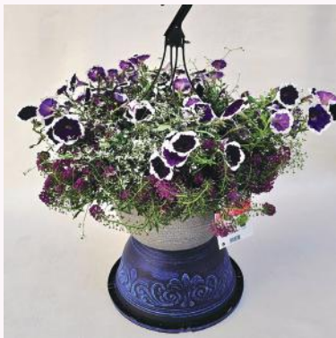
H12.5 Proven Winners® Basket Laurel Marine Blue Changing to 13" Bombay HB in Shaded Graystone