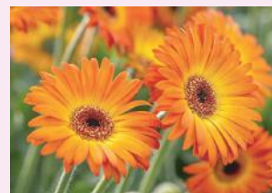
Garvinea Sweet Series

Available in P1 Quart X 8 PK AAC Premium