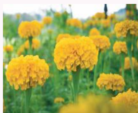
African Marigold Coco Yellow