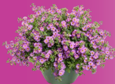
Annual of the Year: Safari® Dusk (Jamesbrittenia)