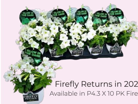
Firefly Returns in 2026!