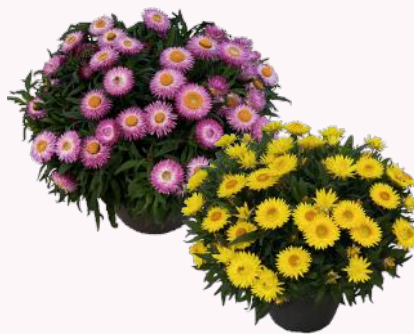
Bracteantha Sunbrero Series