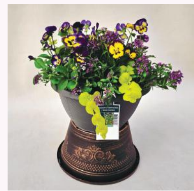
D9.5 Allegro, Salad, Herb, Strawberry Bowl Eden Warm Copper Changing to 10" Palmetto in Vintage Rust

Old 12.5" HB Combo On Bottom. New On Top