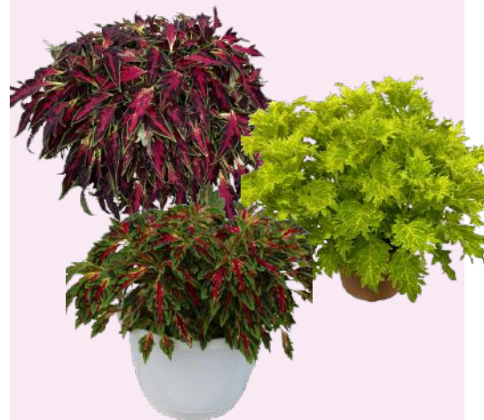
Coleus Terrascape Series

All That Lava, Lime & Shine, All That Jazz