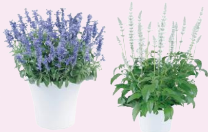
Salvia Sallyfun Series