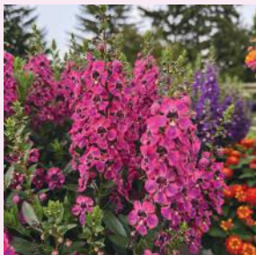
Angelonia Guardian Angel Berry Sparkler