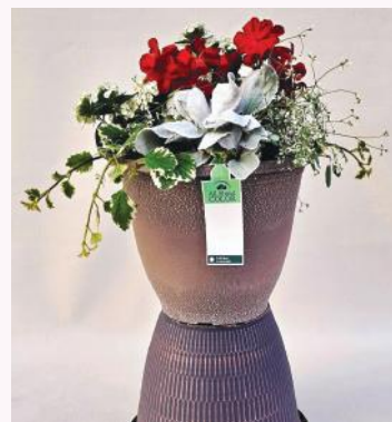
H12.5 Combo & Specialty Begonia Helix Warm Copper Changing to 13" Bombay HB in Powdered Taupe

Old D10.5" Classical On Bottom. New On Top