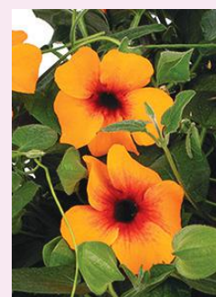
Thunbergia Tower Power Series