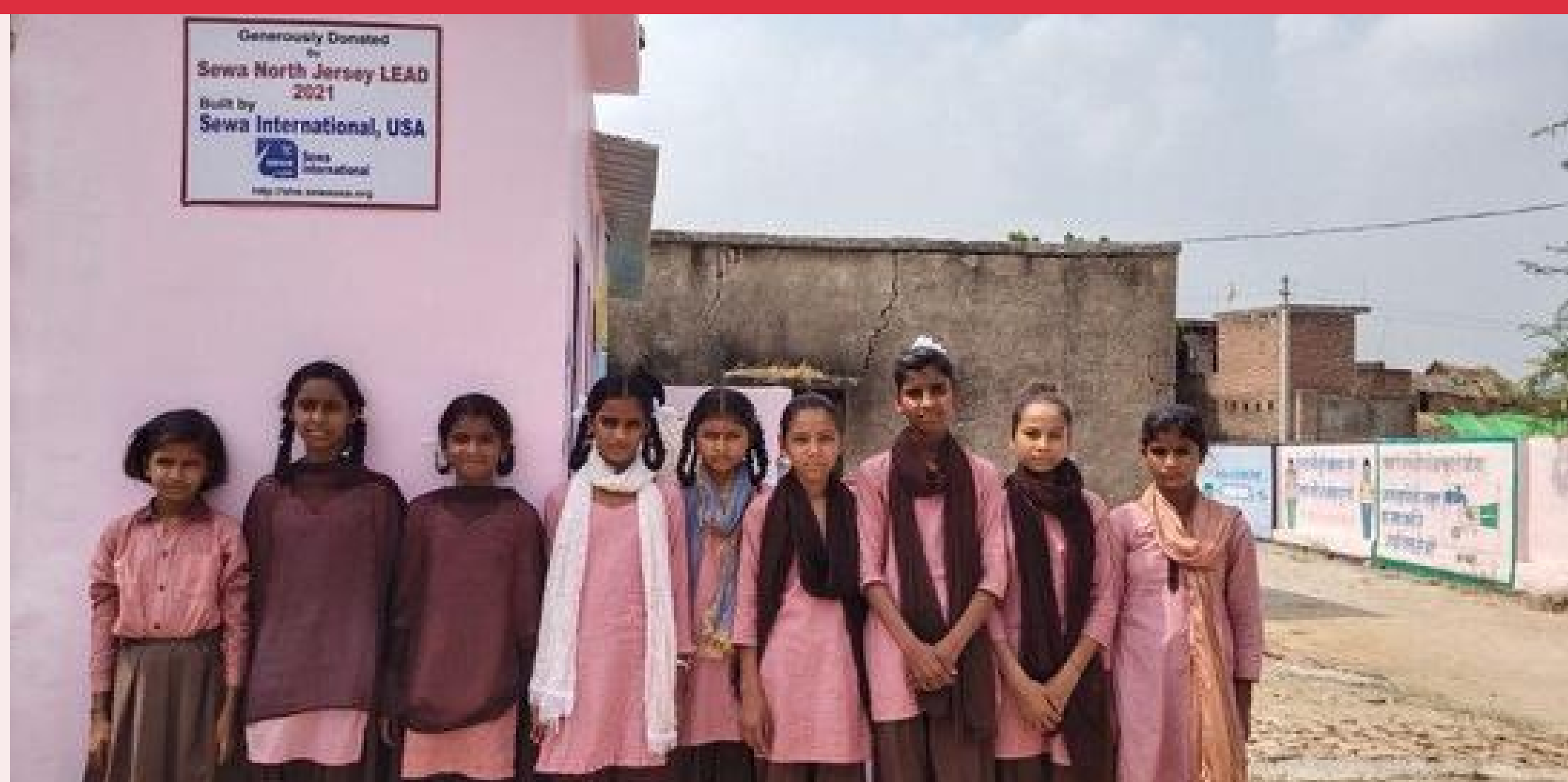
With support from LEAD interns, girl students now have access to proper sanitation facilities