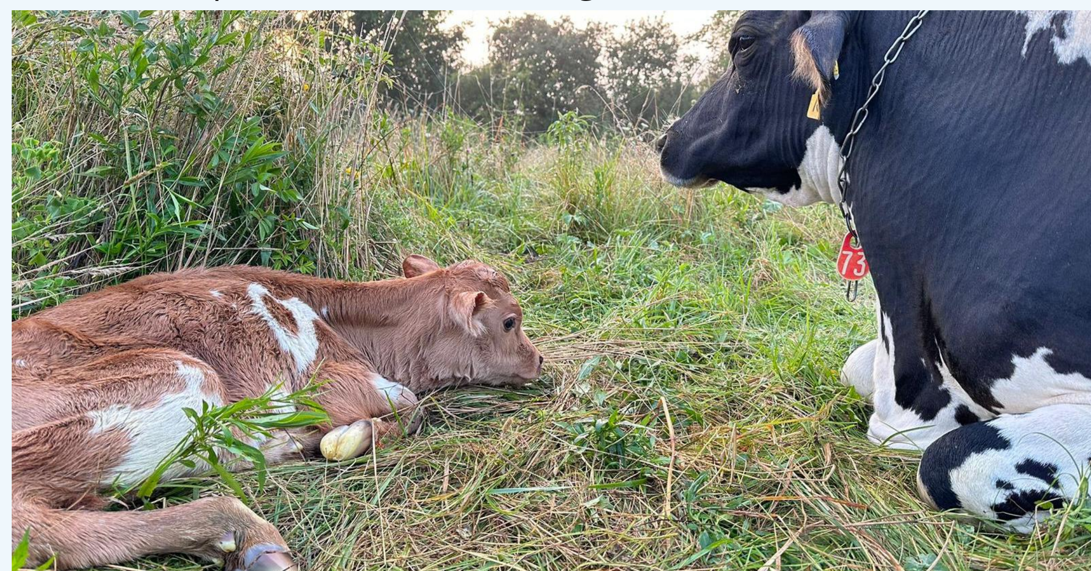
Labangalatika, the newborn calf, with her mother Mangala

They recently rescued two injured cows, from a Vermont dairy farm. These cows never had names, only numbers 73 and 27, and the couple named them Mangala and Kunti.