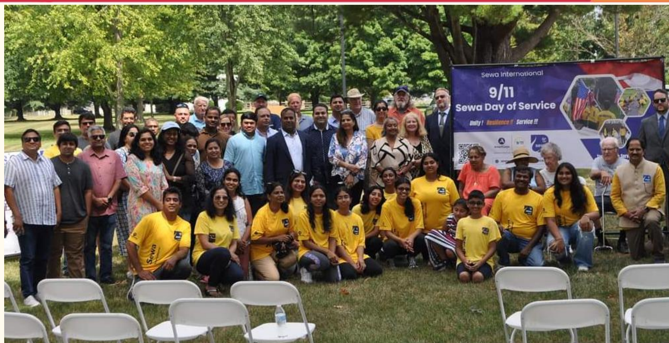
Volunteers and supporters gathered at the groundbreaking ceremony in Chesterfield, NJ