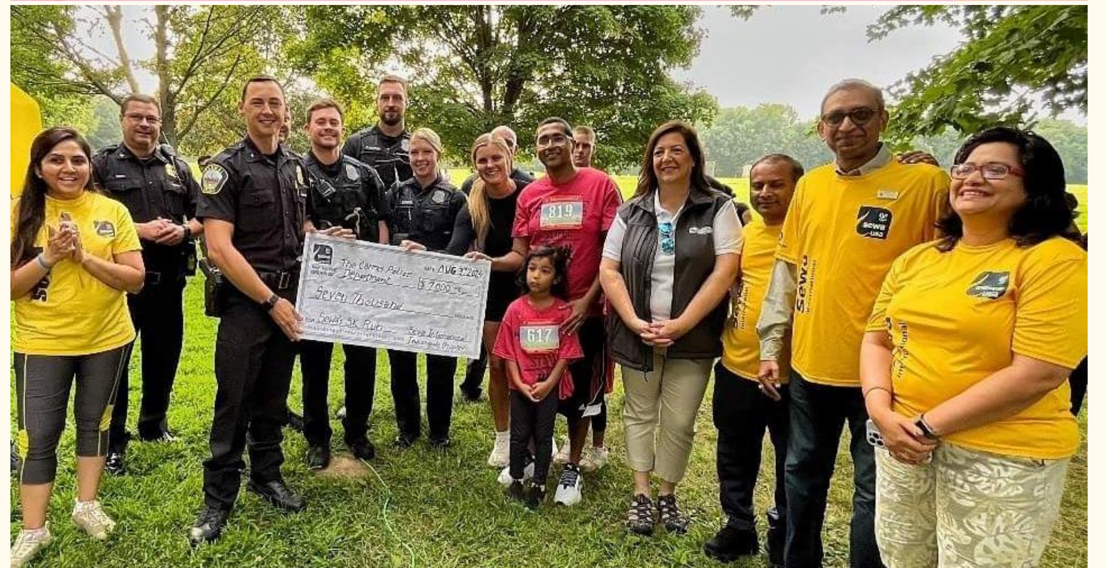
The Carmel Police Department received a donation from the Indianapolis chapter during the 5K run/walk event