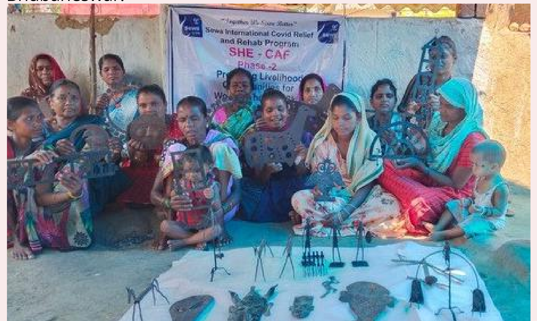
Beneficiaries of Sewa's SHE-CAF program display their wrought iron handicrafts

The SHE team is supporting transgender empowerment through skill development programs, including micro-enterprises for five in Nagpur, tailoring for 25 others in Raipur, and computer training for 50 transgender people in Bhubaneswar.