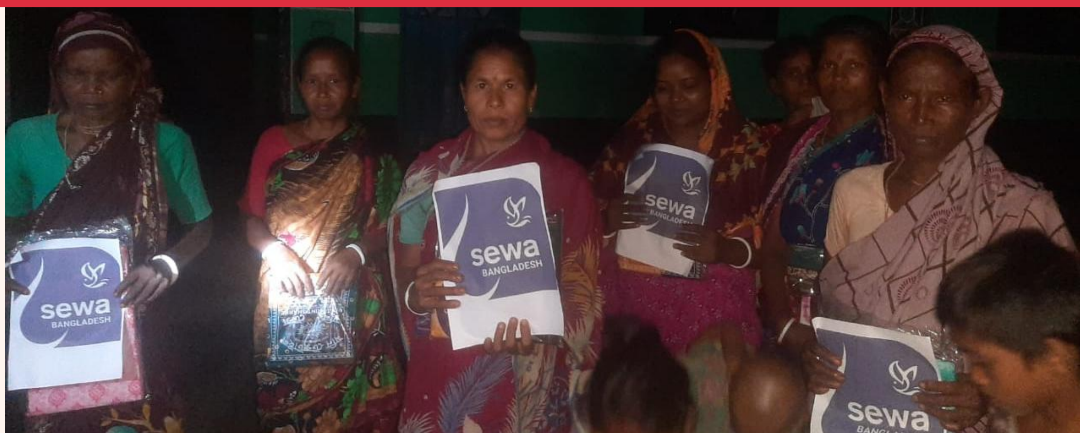
Sewa volunteers provided essential supplies, including food, medical kits, and water bottles to the riot victims in Bangladesh

What began as a student protest in early August tragically escalated into a full-scale attack on minority communities in Bangladesh. Sewa International allocated $10,000 from its emergency fund for immediate relief and launched a fundraising campaign to support the victims. Volunteers provided essential supplies, including food, medical kits, and water bottles.