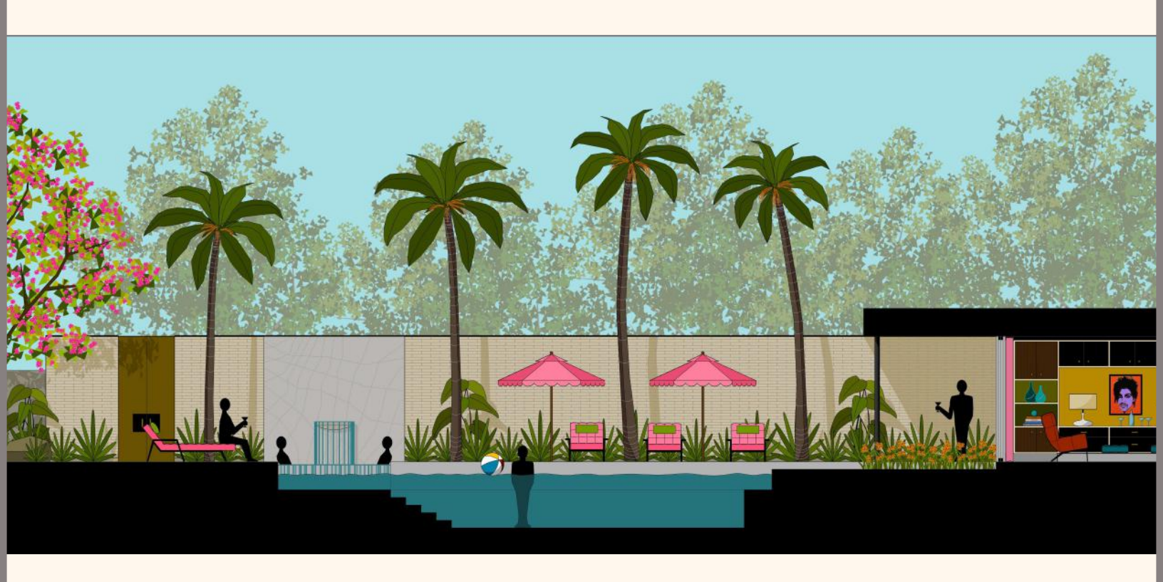
Villa House #7

All furniture and home designs by Jeff Vioski