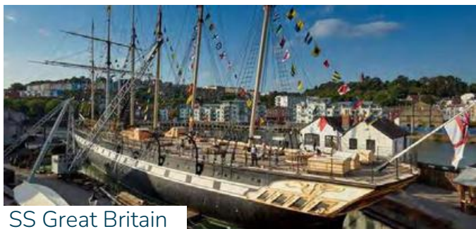
SS Great Britain

Trips to Bristol, Bath and London are organised throughout the year. Other trips may include meals out, theme parks, theatre trips, places of historical interest, sporting events and more! These trips are optional, but a great way to explore the UK and get an authentic British experience.