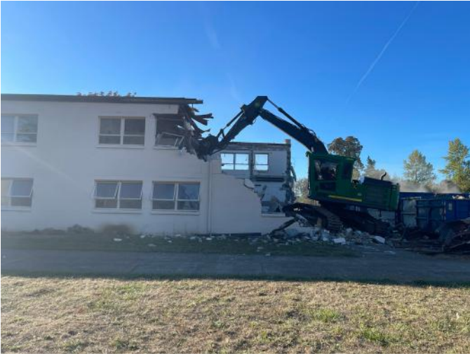
The old Preschool Building getting torn down to make way for the new Elementary Building!