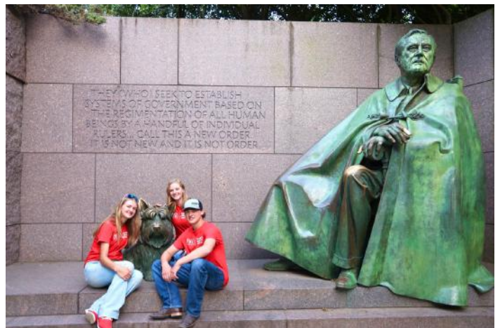
A highlight for WLC attendees is a night tour of prominent monuments including the Franklin D. Roosevelt monument.