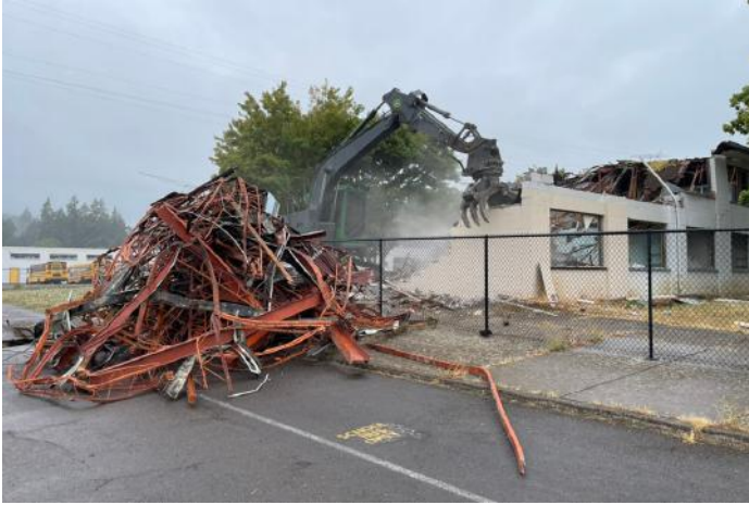
Demolition of the Laborer's Training Building. This demo will open up space for the new Elementary Building.