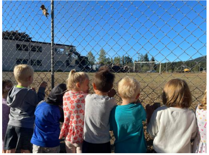
Preschool students getting a front row seat to the demolition!