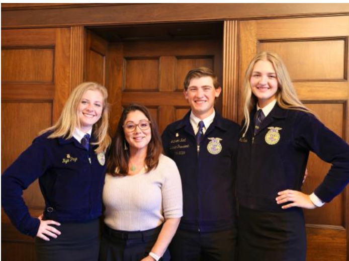
The students had an opportunity to talk about FFA and agriculture policy with one of Oregon's newest congressional representatives, Congresswomen Lori Chavez-Dereemer (CD5).