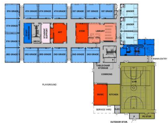
Elementary building layout.