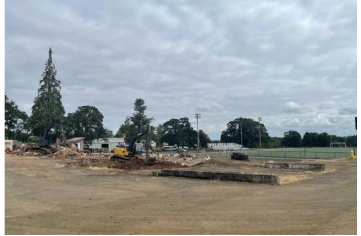
Demolition of the Field House. The new space now provides more parking for families and fans.

As part of the preparation for the new elementary building at SC, we have begun the demolition of a few older buildings on campus. While these buildings have served us well over the years, their removal is essential to make room for the state-of-the-art facility that will better serve our elementary students' needs. This phase of the project began in late August and will continue through the month of September. Though it marks the end of an era for these spaces, this is an exciting step forward as we continue to invest in the future of our school and students.