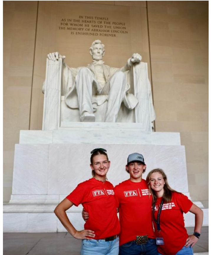
The monument tour included the famed Lincoln Memorial.