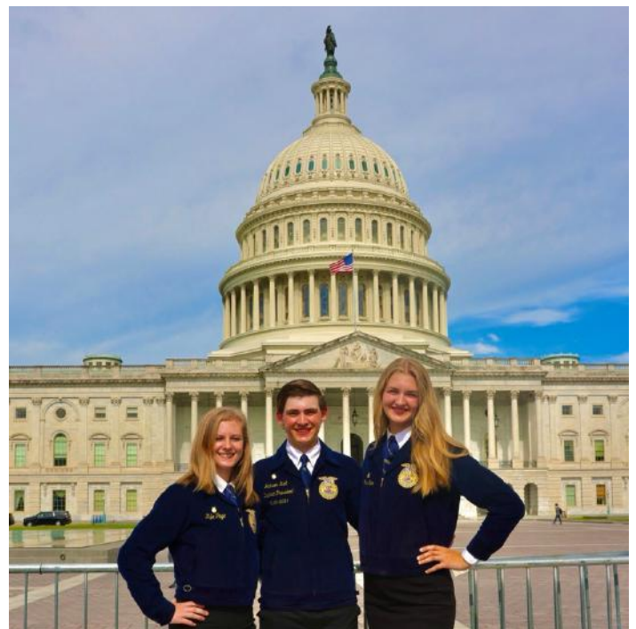
Time on Capitol Hill included a tour of the US Capitol building and 3 congressional meetings.