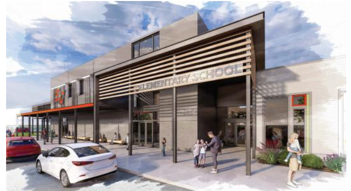
Elementary Building, South facing courtyard and playground.