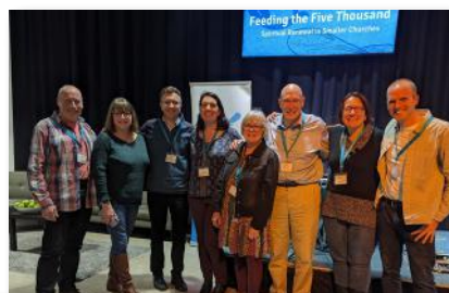
Key supporters of Alive in Christ marking its launch