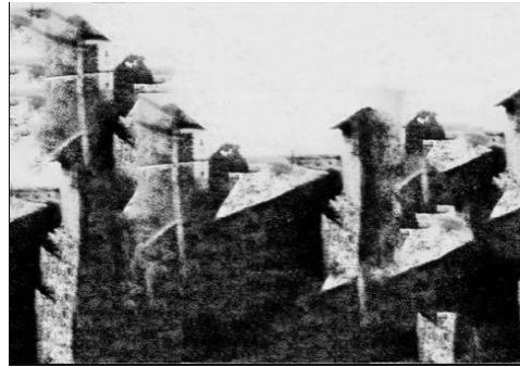
Enhanced version of Nicéphore Niépce's View from the Window at Le Gras (1826)

WHAT DOES THE WORLD'S OLDEST KNOWN PHOTOGRAPH DEPICT THE VIEW OUT OF A WINDOW IN FRANCE?