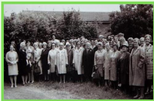
The Women's Meeting 1944 (Now known as Thursday Fellowship)