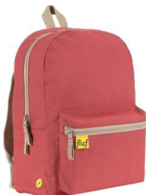
BRICK RED BP-RED-03