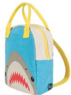
BABY SHARK LBP-BSHK-01