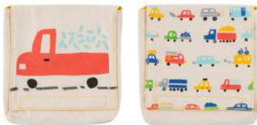
CARS SET OF 2 SP-CARS-15