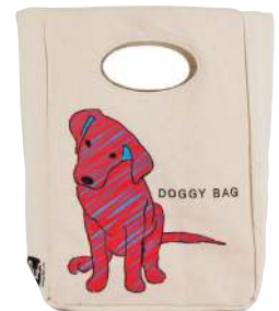
DOGGY BAG LU-DOG-06