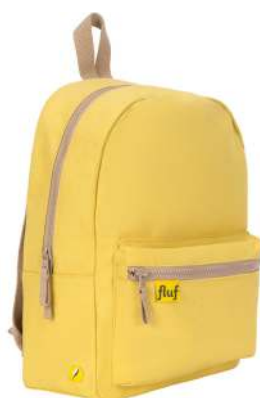
NEW YELLOW BP-YLW-07