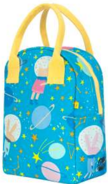
NEW ASTRO PARTY ZLU-ASTP-23