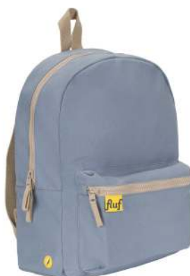
MID BLUE BP-BLUE-01