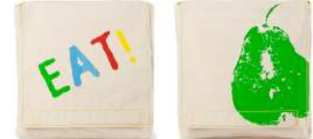
GOOD EATS SET OF 2 SP-EAT-02