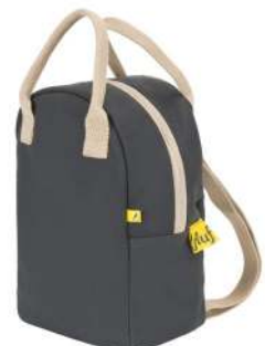
BLACK SOLID LBP-OBLK-13