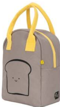
NEW HAPPY BREAD GREY ZLU-HBGY-31