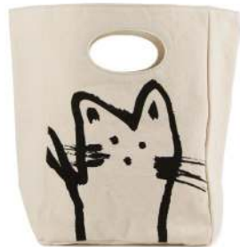
HEY CAT LU-CAT-33