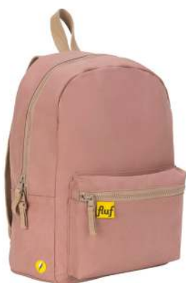
NEW MAUVE BP-MVPT-06

Size: 16.5"(L) x 12"(W) x 6"(D) / 22L 100% certified organic cotton 100% recycled polyester padding