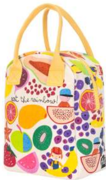
NEW EAT THE RAINBOW ZLU-EATR-24