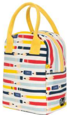
NEW PENCILS ZLU-PNCL-26