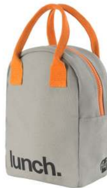
LUNCH GREY/PUMPKIN ZLU-LUPK-16