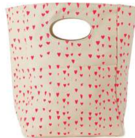
FLOATING HEARTS LU-FHT-30