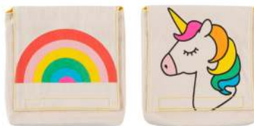
RAINBOWS SET OF 2 SP-RBW-16