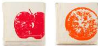
APPLES & ORANGES SET OF 2 SP-APO-01