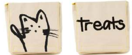
MEOW SET OF 2 SP-CAT-09