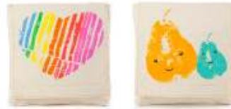
MAMA LOVE SET OF 2 SP-MML-03