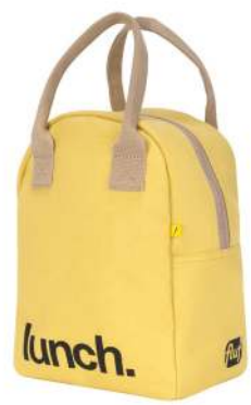
NEW LUNCH YELLOW ZLU-YLW-29