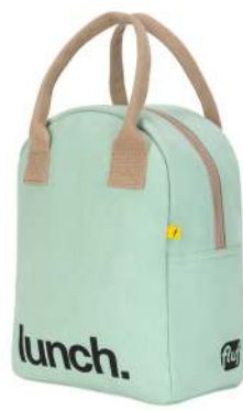
NEW LUNCH MINT ZLU-MINT-27