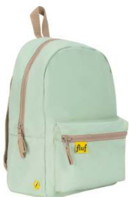
NEW MINT BP-MINT-05