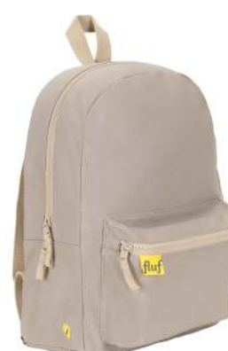
SMOKE GREY BP-SMK-04