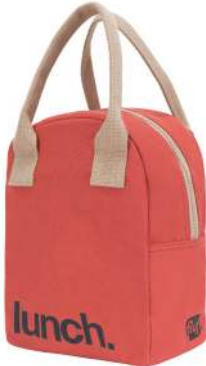
LUNCH RED ZLU-RED-18