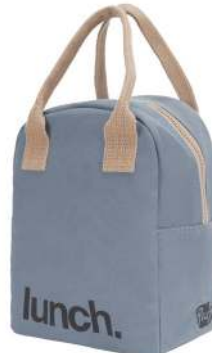
LUNCH BLUE ZLU-BLUE-17