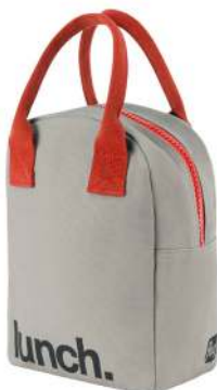
LUNCH GREY/RUST ZLU-LUBG-14