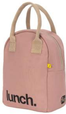
NEW LUNCH MAUVE ZLU-MVPT-28