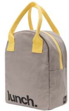
LUNCH GREY/YELLOW ZLU-LUG-03