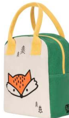
NEW FOX ZLU-FOX-25