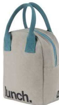
LUNCH GREY/MIDNIGHT ZLU-LUMN-15