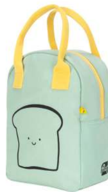
NEW HAPPY BREAD MINT ZLU-HBMT-30