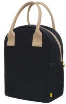
BLACK SOLID LBP-OBLK-13