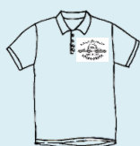
Polo Shirt £15.00