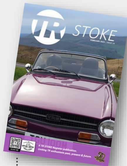
..... Front Cover: (TR6 Magenta) Autumn Run - Peak District (Cat & Fiddle)