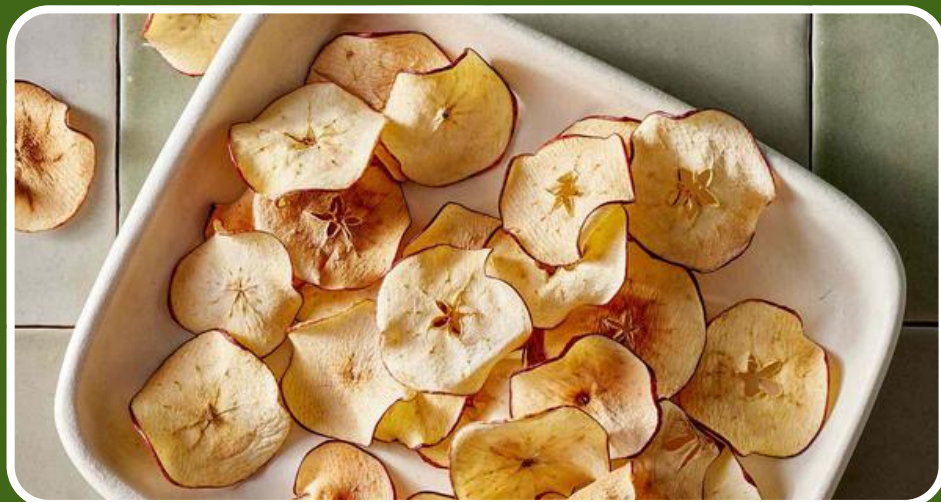
Dehydrated Apple Rings