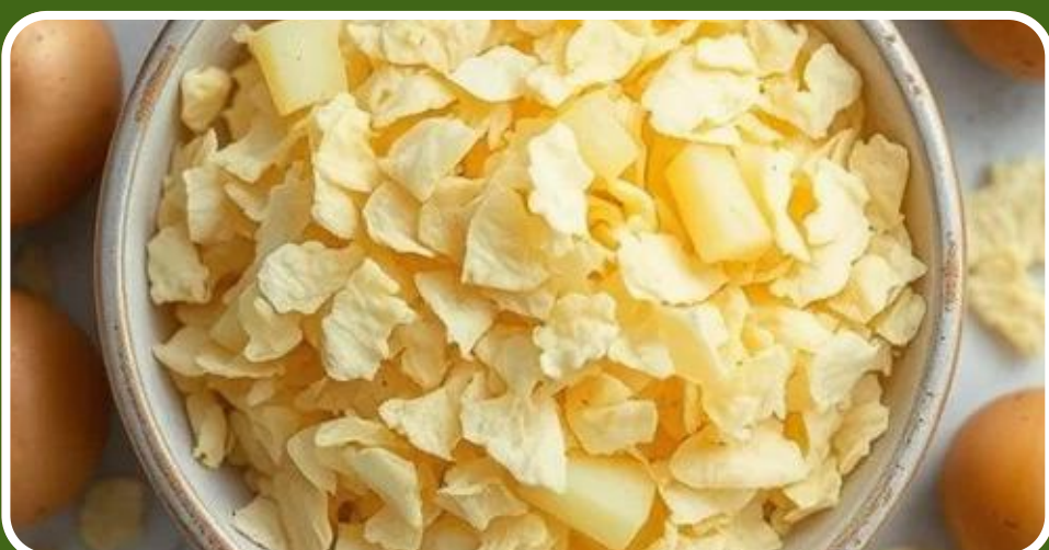
Dehydrated Potato Flakes