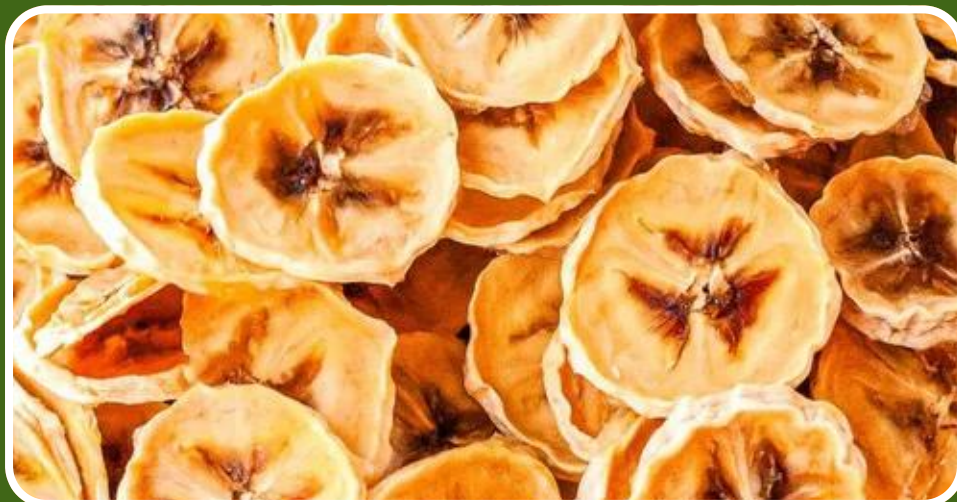
Dehydrated Banana Chips