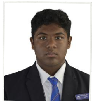
SAHASTRAJITH A X D

SECOND PLACE - BHAGAVTH GEETHA RECETATION HOSTED BY VVS HIGH SCHOOL