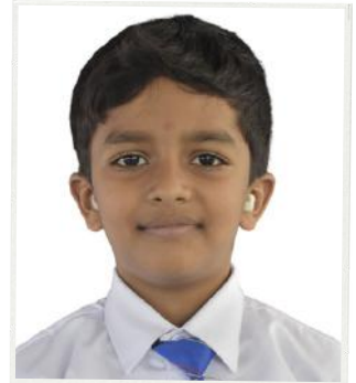
KADAMBA III B

GOLD MEDAL U-8 CATAGORY AT OPEN STATE TAEKWONDO CHAMPIONSHIP 2024 ORGANIZED BY BENGALURU TAEKWONDO