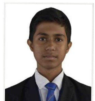
PUNEETH V X D

WINNERS OF MIND CURRY - QUIZ COMPETITION BY CHRIST UNIVERSITY BANGALORE RANIANS MIND WIZARDS QUIZ FINALISTS ALLIANCE UNIVERSITY SPACE SCIENCE QUIZ RUNNER-UP SAINT GERMAIN GENERAL QUIZ SECOND RUNNER UP