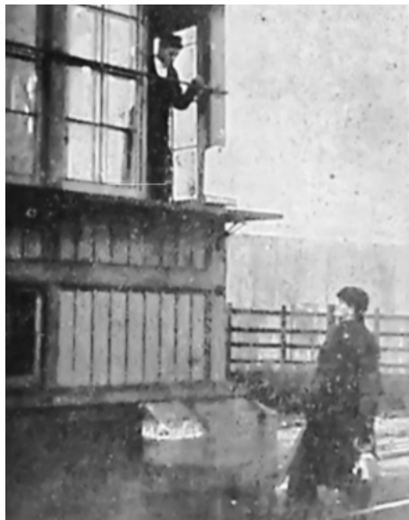
They were talking about revival

In early 1905 a passenger guard, writing in The Railway Signal , celebrated that railwaymen were receiving a ‘good share of the blessing’. For example, a GWR signalman was talking with a colleague about the revival, when they heard singing from a nearby openair meeting. It took the signalman back to Sunday School days when his teacher had taught him to pray “Lord, show me myself.”