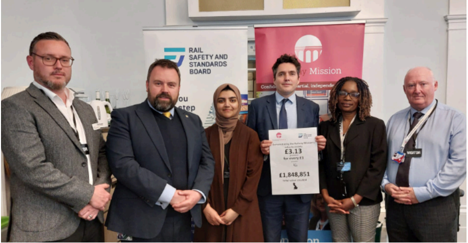
Railway Mission was represented at the RSSB's reception in Westminster with Rail Minister Huw Merriman