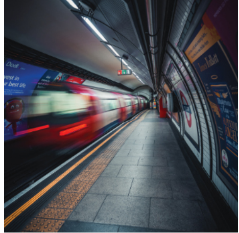
London Underground train on its way out of a station

Railway Mission is a registered charity in England and Wales (1128024) and in Scotland SC045897). A company limited by guarantee in England and Wales (06519565)