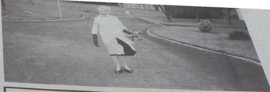
Resident picking up paper

...in this at the General Meeting on Monday night, hopefully there will be a positive response.