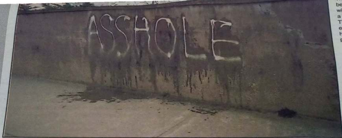
A WALL IN ELMPARK THE DAY AFTER A GRAFFITI CAMPAIGN BY VANDALS