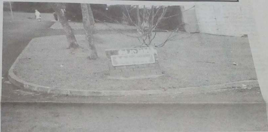
Vandalised sign in Elm park