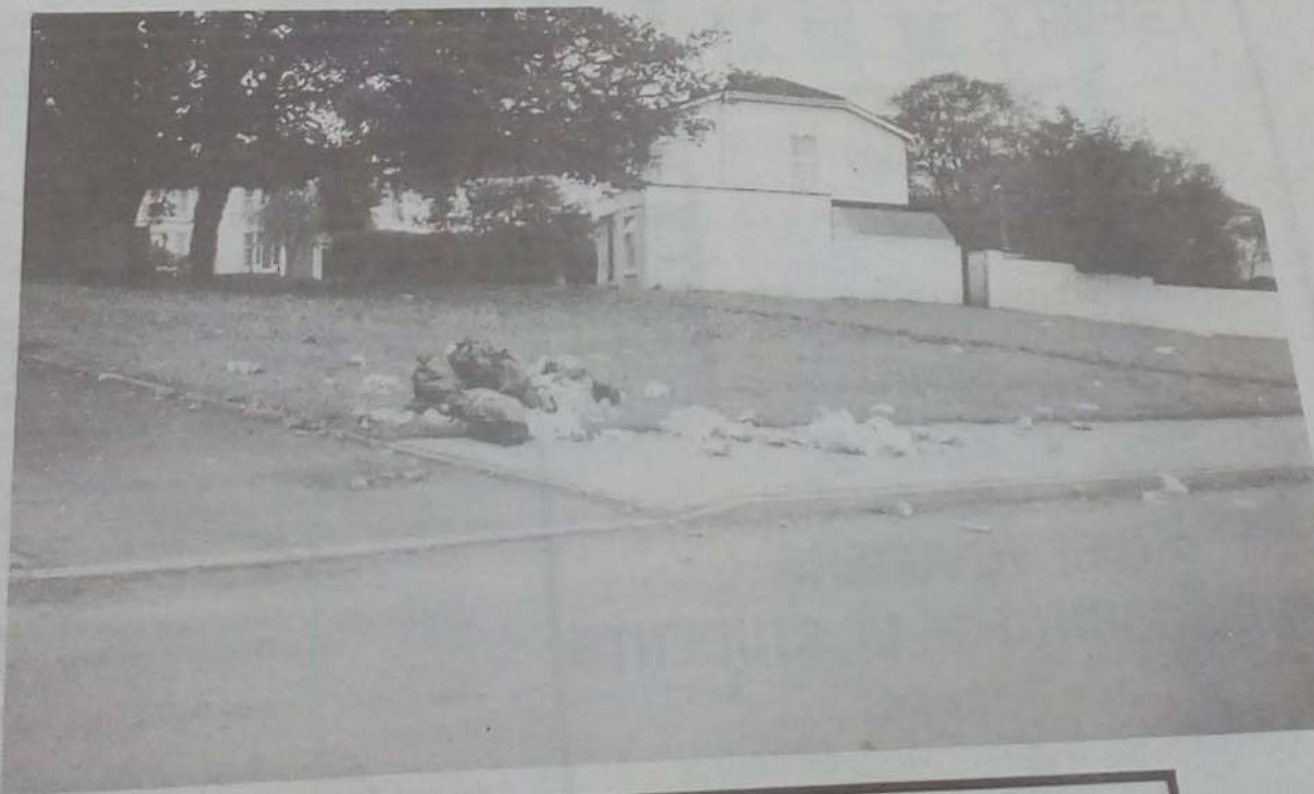
Rubbish screwn across the street