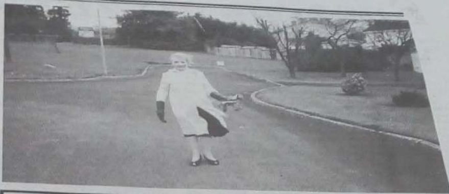
Resident picking up paper