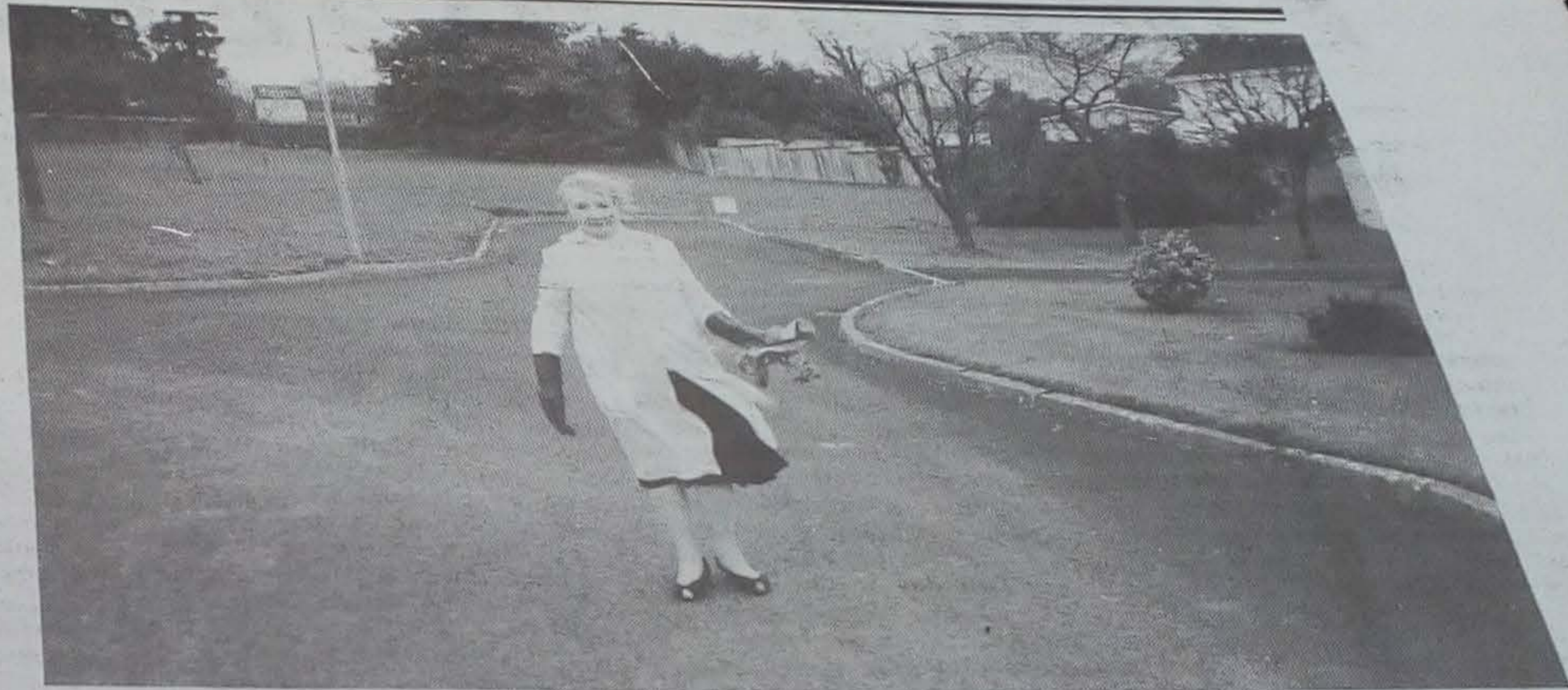
Resident picking up paper

elderly woman's house. This woman was afraid to let me take a photo of her the next day with suds and wire brush in hand for fear of recriminations. I mean these guys might come back and write something worse like STUPID ASSHOLE huh huh cool! I mean lads lets look at it, lets look at all the wild stories you'll have when your older looking back at your mad youth, you'll be able to say that you were part of that infamous gang who wrote dirty words on dirty walls lads I wanna be in your gang. Do I have to pass a literacy test! Do I have to get turned on writing dirty words or is it that I have to be a Virgin. So Virgins why don't you get a life you know, like chill out abit have a few beers relax. I mean what's the point in these pathetic acts, if you're frustrated with your Virgin status don't worry it's a common enough trait you're not a lone. So to the Virgin(s) in question all I can say is to hang on in there and try to express your problems through the proper channels e.g Helplines etc