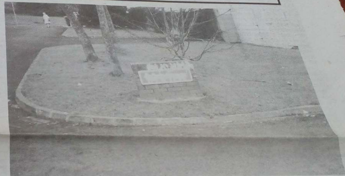
Vandalised sign in Elm park