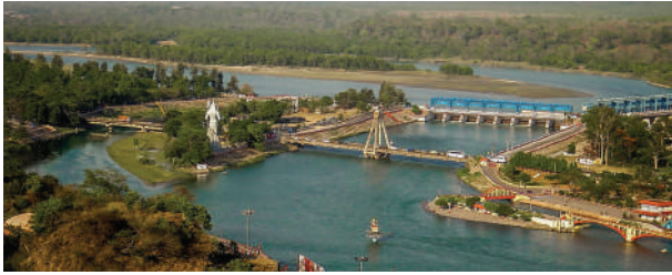
Ganga River - Haridwar

The length of the river Ganga is about 2,525 km. Its major tributaries from the north are Gomti, Gandak, Kosi and Ghaghra and from south are Yamuna (the largest tributary of Ganga), Son, Chambal etc. The river Ganga is known as the River Padma in Bangladesh. The combined river of Ganga and Brahmaputra creates the World's largest delta known as Sundarbans in Bangladesh before joining the Bay of Bengal.