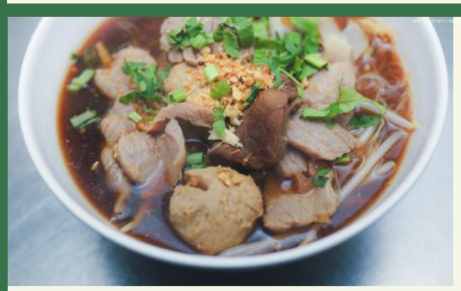
59. Guay Tiew Num

Thin rice noodle cooked in Traditional Thai's soup with homemade meatballs, stew meat, beansprout, spring green, coriander and fried garlic.