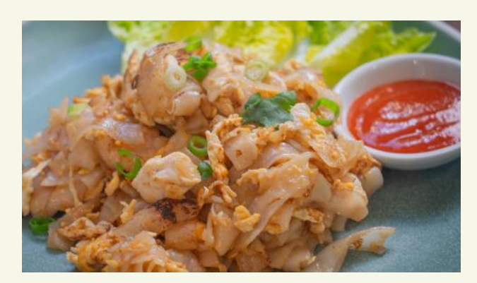
55. Guay Tiew Khua

Vegetable + Tofu 14.95 | Chicken 15.95 Pork 15.95 | Beef 15.95 | Prawn 16.95