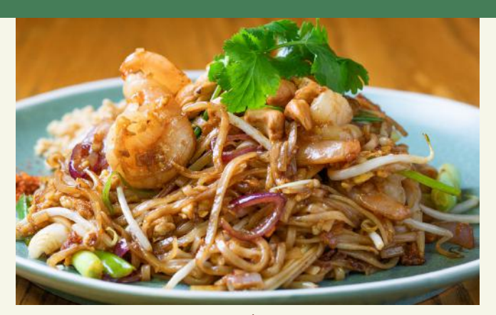
10. Pad Thai

Rice noodles with dried turnips, beansprouts, spring onions, peanut and red onion.