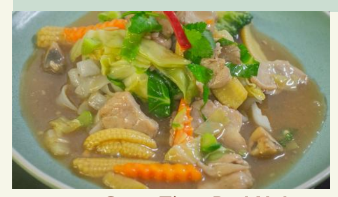
54. Guay Tiew Rad Nah

flat noodle top with special Thai gravy sauce and vegetables.