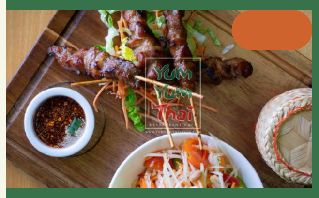
22 . Som Tum Moo Ping £23.95

Red curry with duck, pineapple, sweet basil and cherry tomatoes.