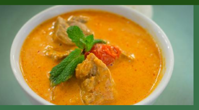
21. Kang Ped Pet Yang £16.95

Red curry with duck, pineapple, sweet basil and cherry tomatoes.