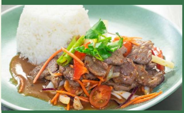
23. Yum Nua

Thai grilled pork on a skewer served with green papaya salad, carrots, tomatoes, peanut, garlic, fresh chilli and sticky rice