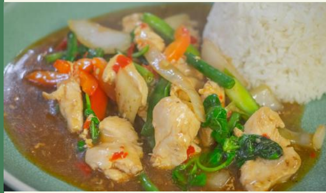
8. Pad Kra Praw

Stir fried with baby corn, onions and fresh