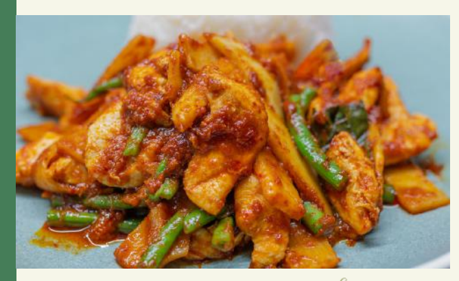
9. Pad Prik King

Stir fried with fresh chilli, french beans, Thai basil and lime leaves.