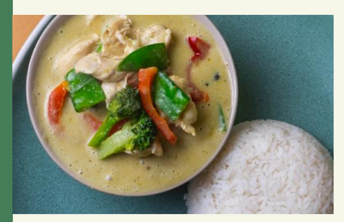
13. Kang Kieo Warn

Green curry with peppers, aubergine, broccoli, mange tout, sweet basil and lime leaves.