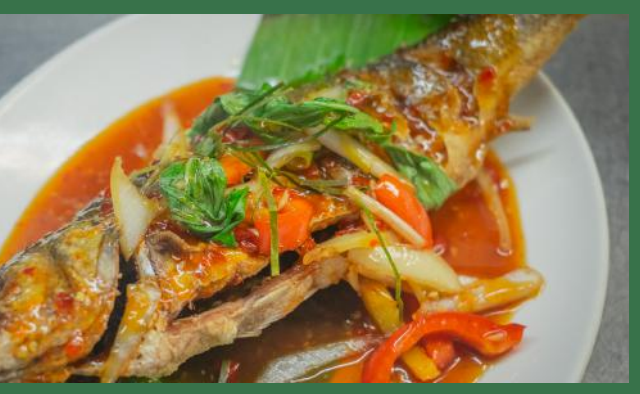
24 . Pla Rad Prik <u>//</u> £25

Grilled marinated topside of beef tossed in a spicy salad with sweet basil.