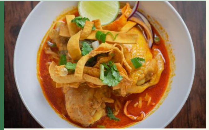
57. Khao Soi Northern Thai Curry Noodles Soup | Chicken 16.95 | Beef 16.95 | Crispy belly pork 16.95

Vegetable + Tofu 14.95 | Chicken 15.95 Pork 15.95 | Beef 15.95 | Prawn 16.95