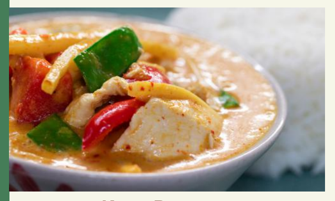
14. Kang Daeng

Red curry with bamboo shoots, peppers, mange tout, lime leaves and sweet basil.