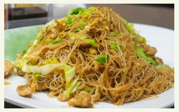
11. Pad See Ew

Stir fried rice noodles with green leaf.