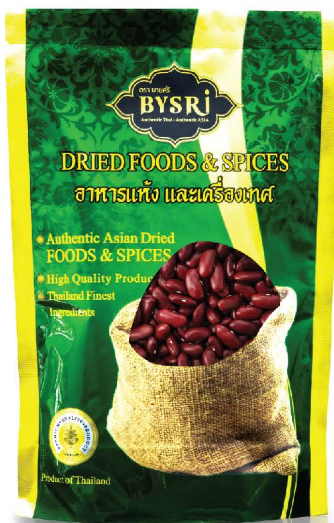
RED KIDNEY BEAN BYSRI BRAND