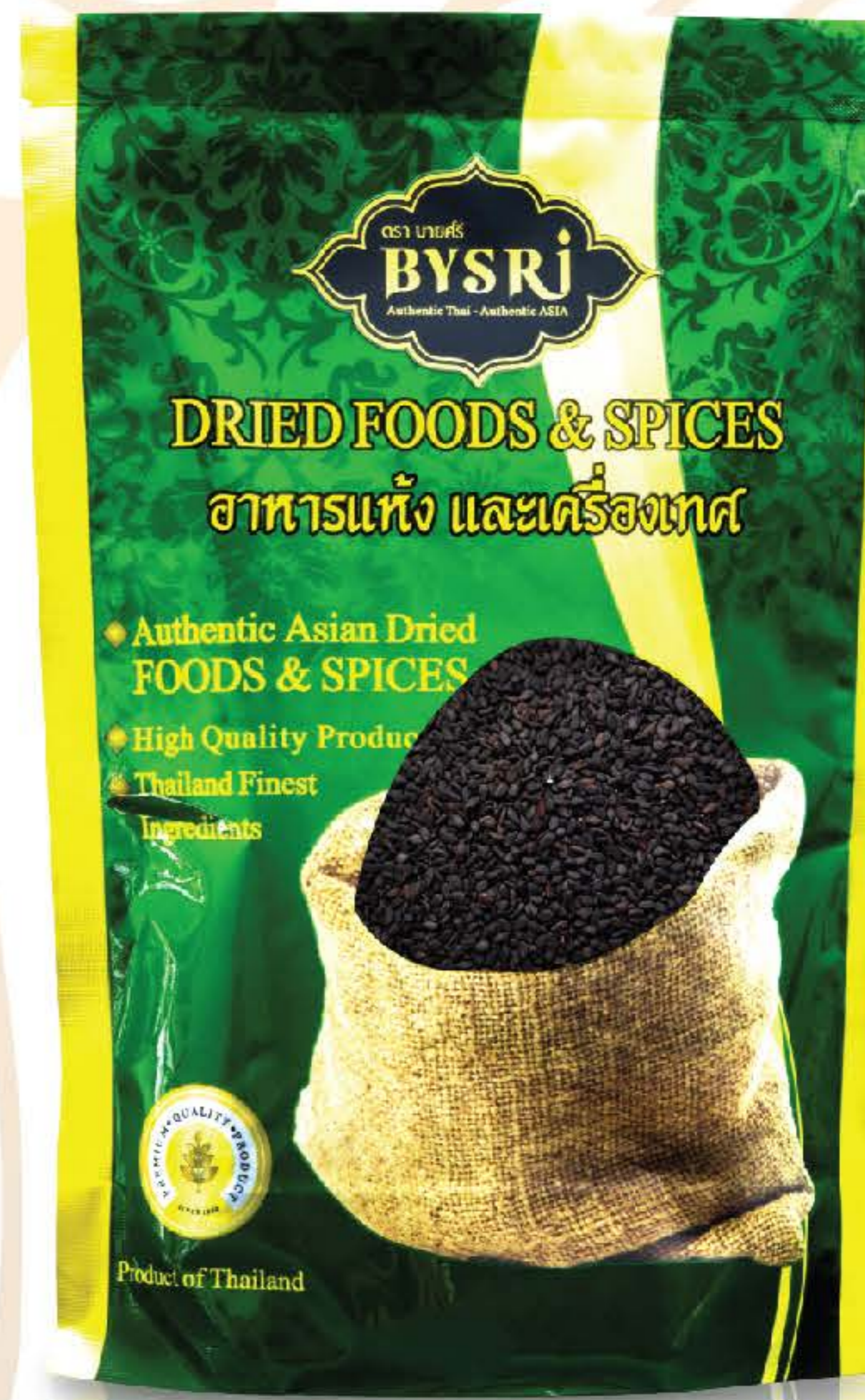
BLACK SESAME BYSRI BRAND