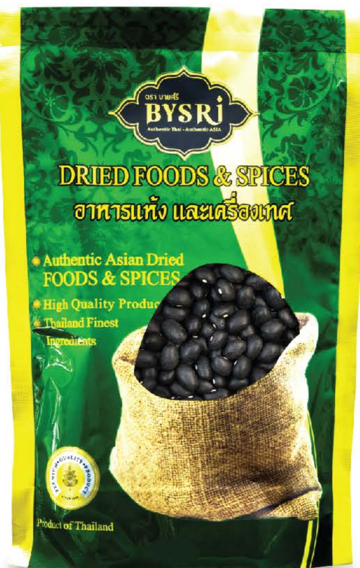
BLACK BEAN BYSRI BRAND