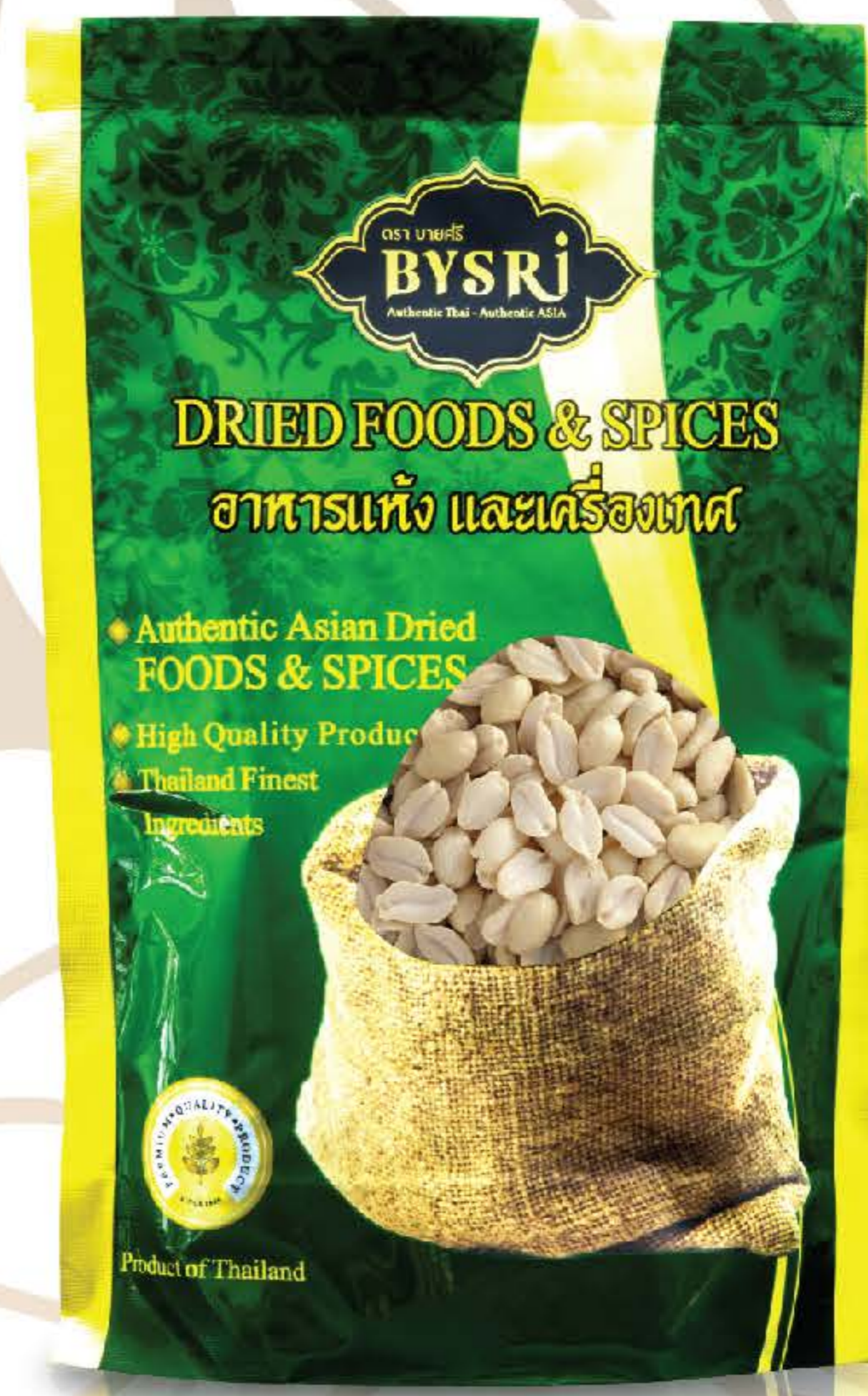
PEELED PEANUT BYSRI BRAND