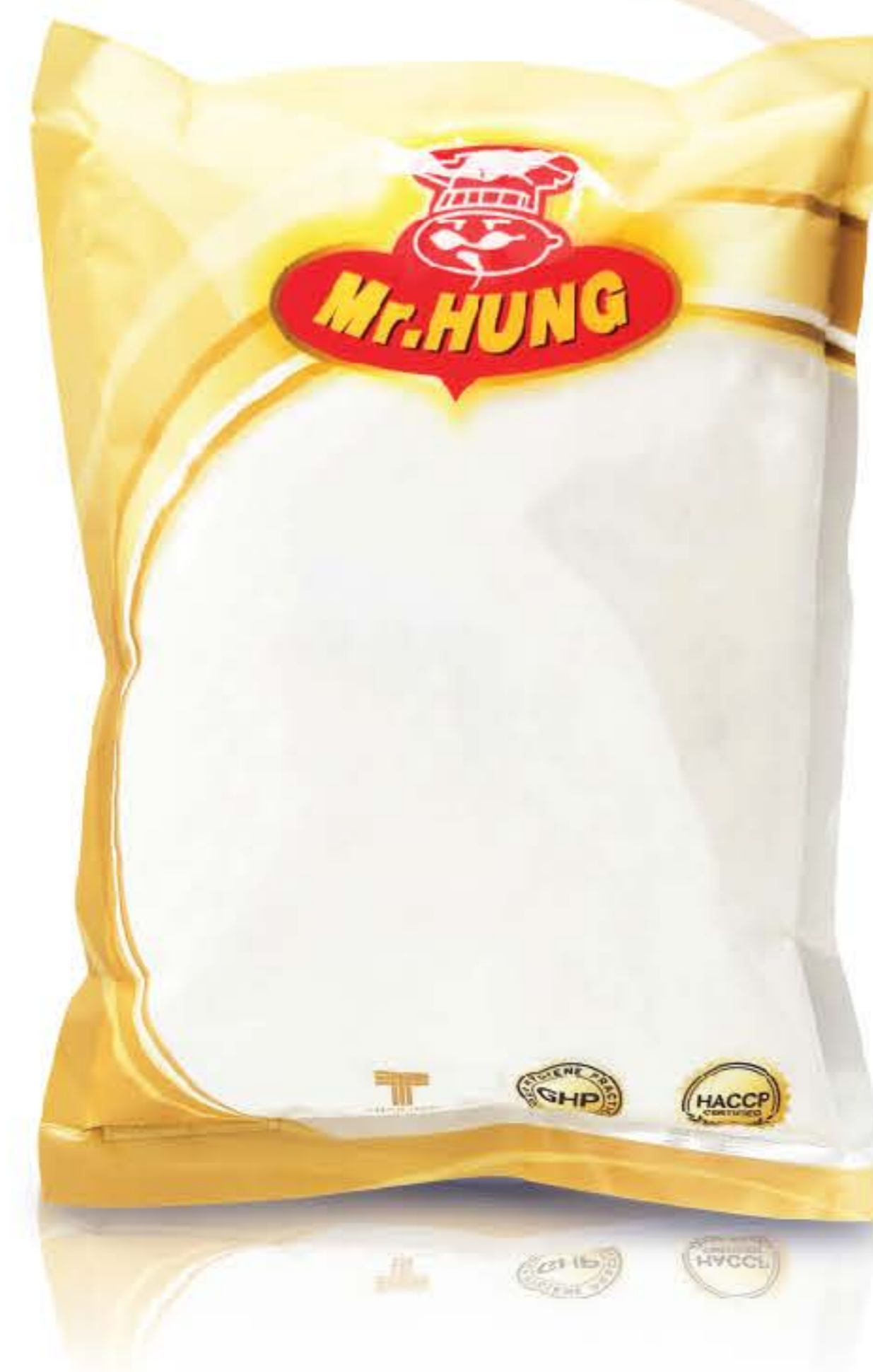
RICE FLOUR MR. HUNG BRAND