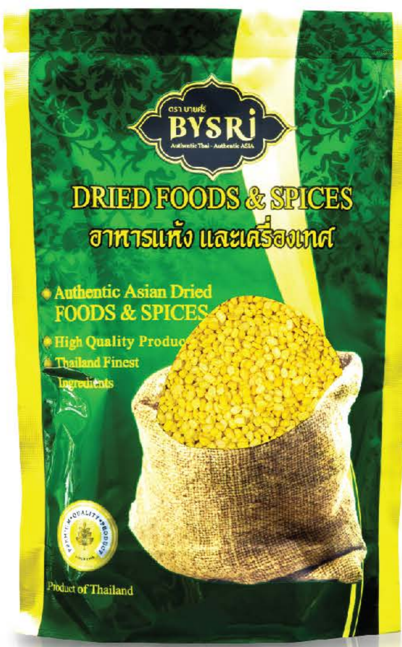
PEELED SPLIT MUNG BEAN BYSRI BRAND