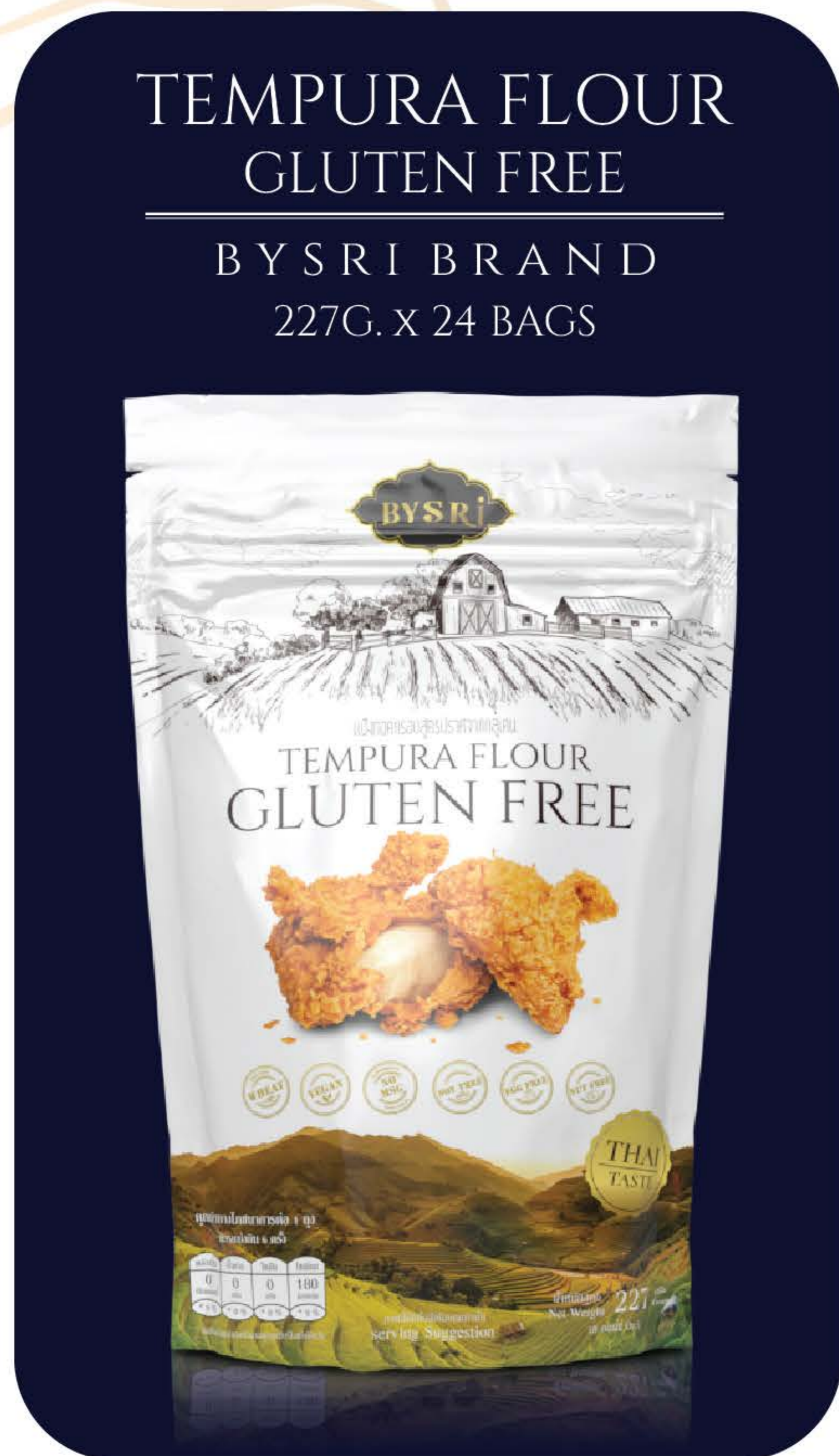
TEMPURA FLOUR GLUTEN FREE BYSRI BRAND 227G. x 24 BAGS