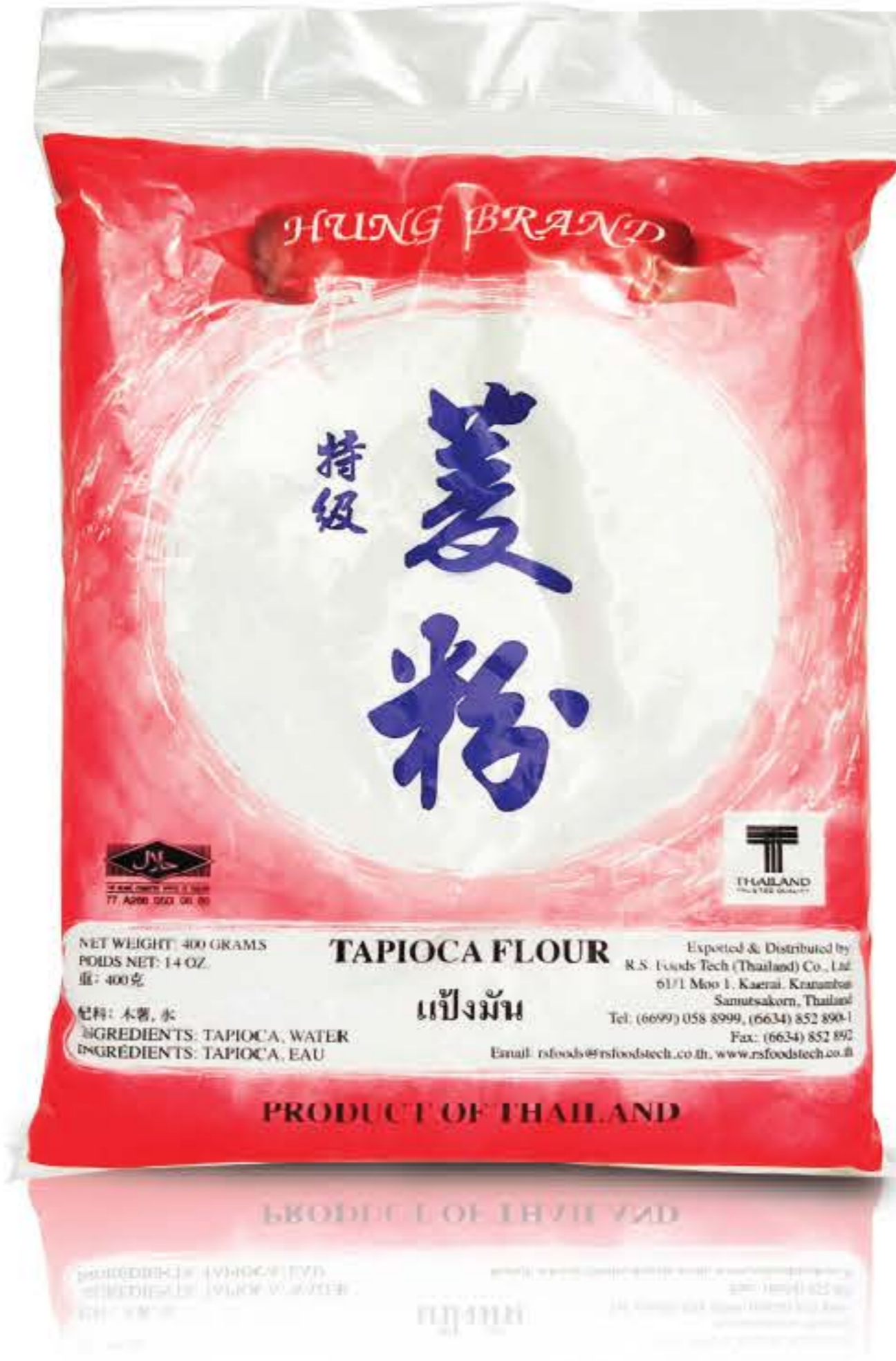
TAPIOCA STARCH HUNG BRAND