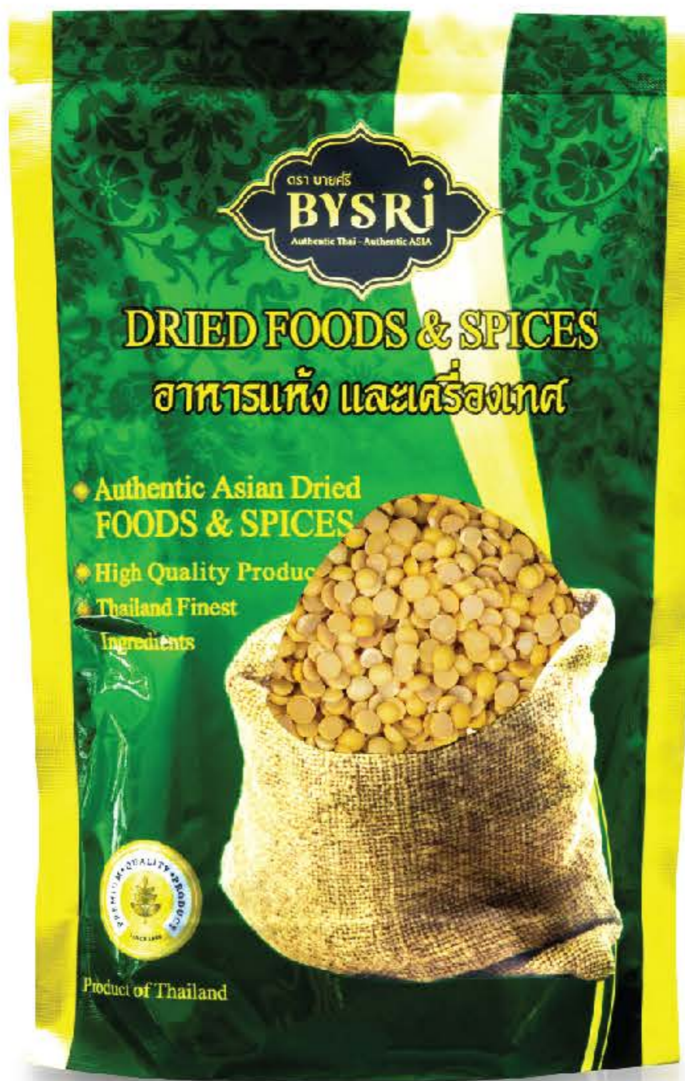
PEELED SPLIT SOY BEAN BYSRI BRAND