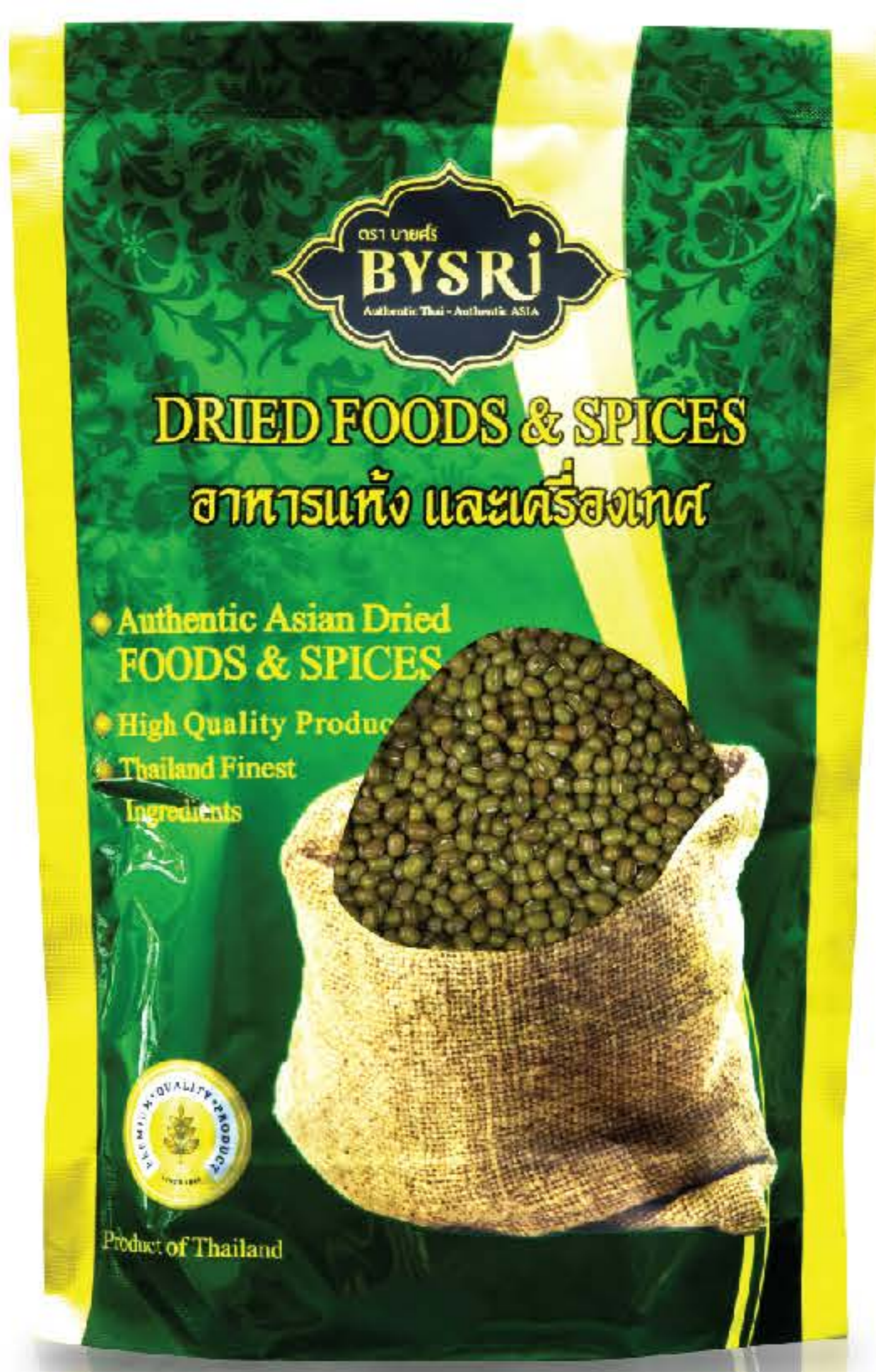
MUNG BEAN BYSRI BRAND