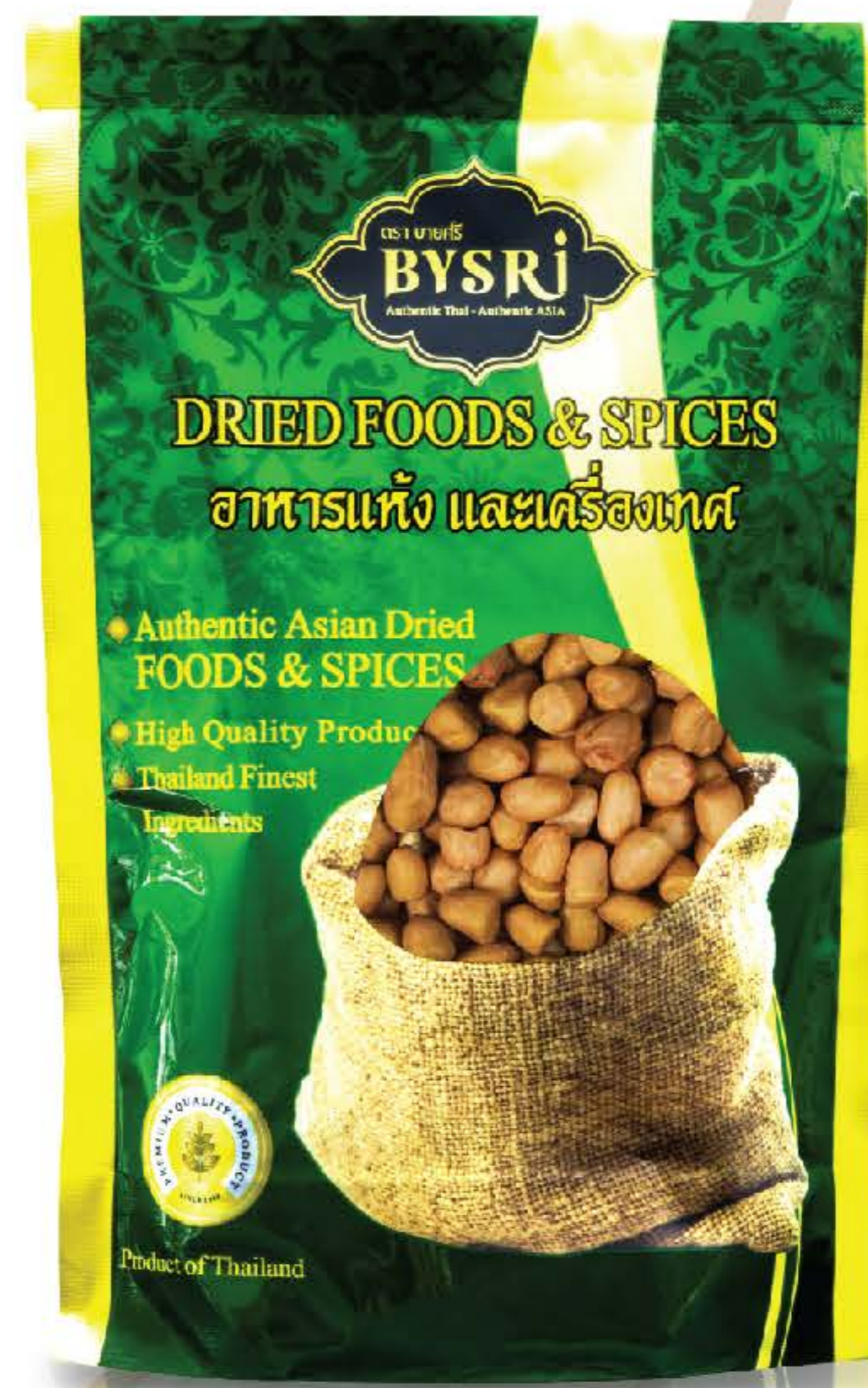
PEANUT BYSRI BRAND