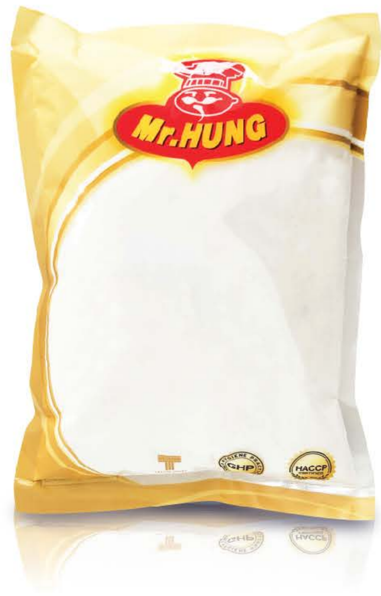
TAPIOCA STARCH MR. HUNG BRAND