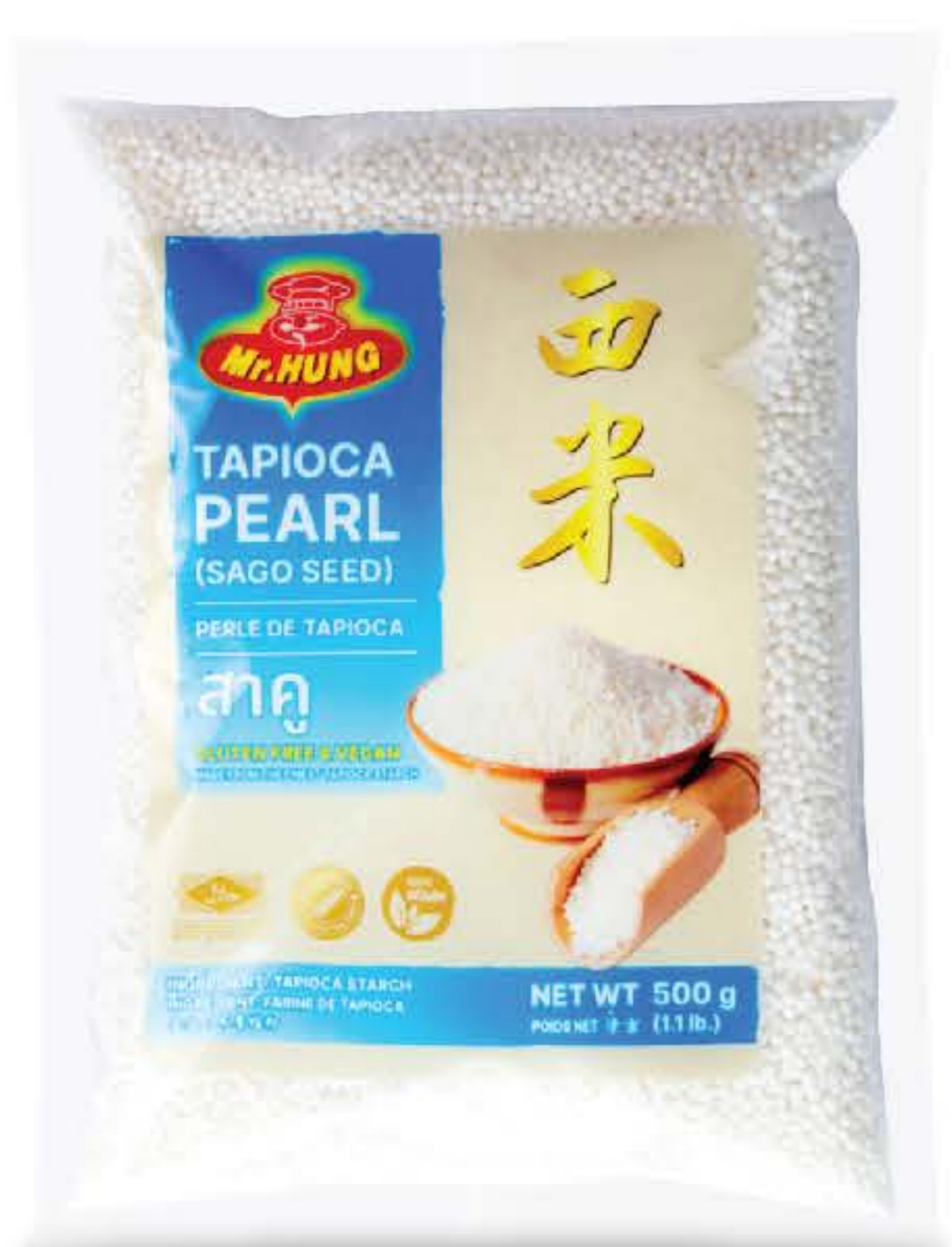
SMALL WHITE SAGO MR. HUNG BRAND