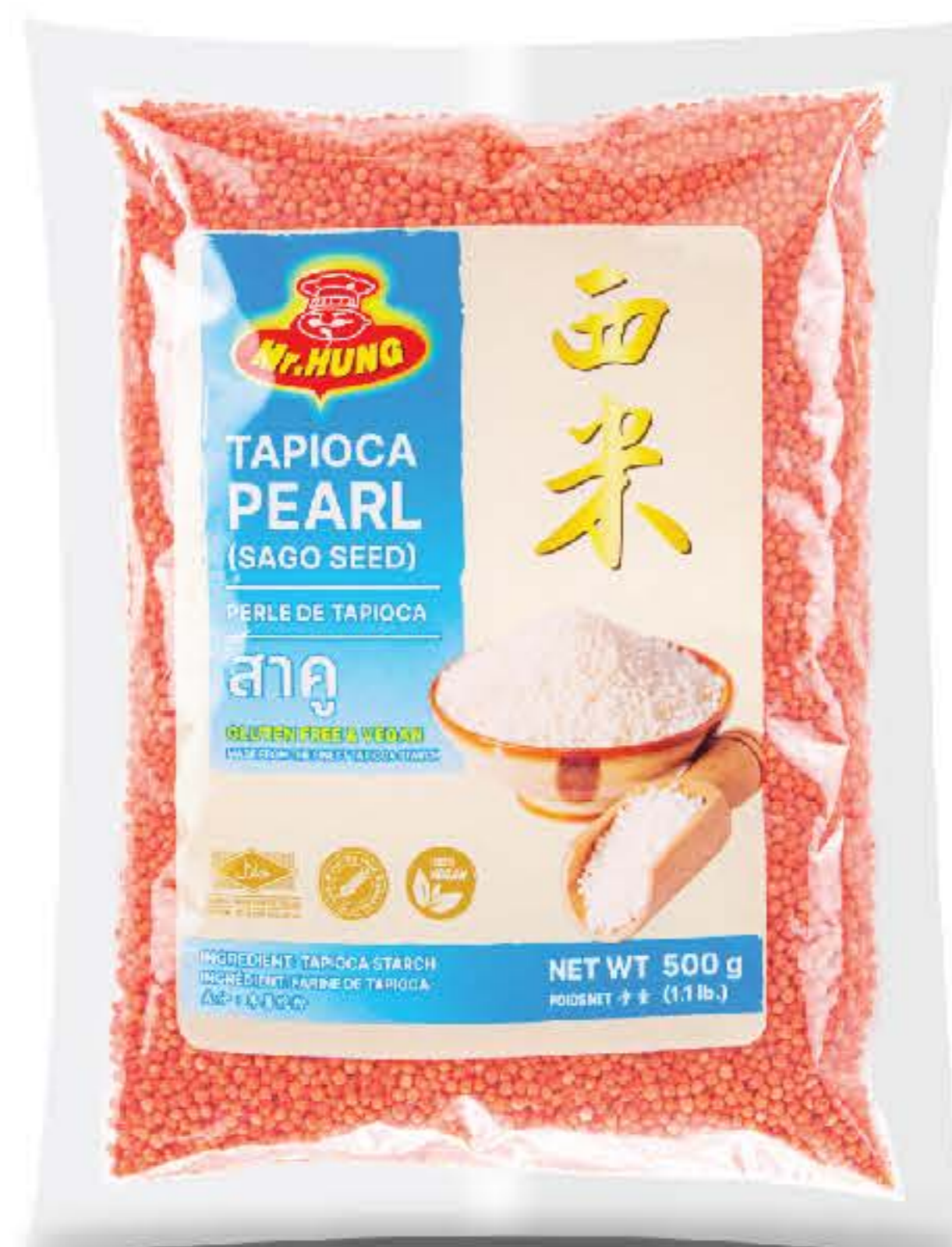
SMALL RED SAGO MR. HUNG BRAND