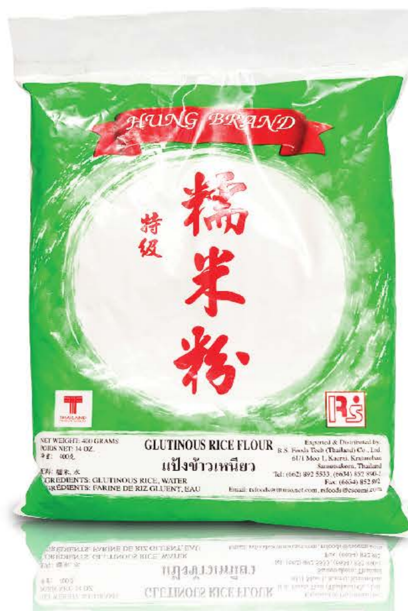
GLUTINOUS RICE FLOUR HUNG BRAND