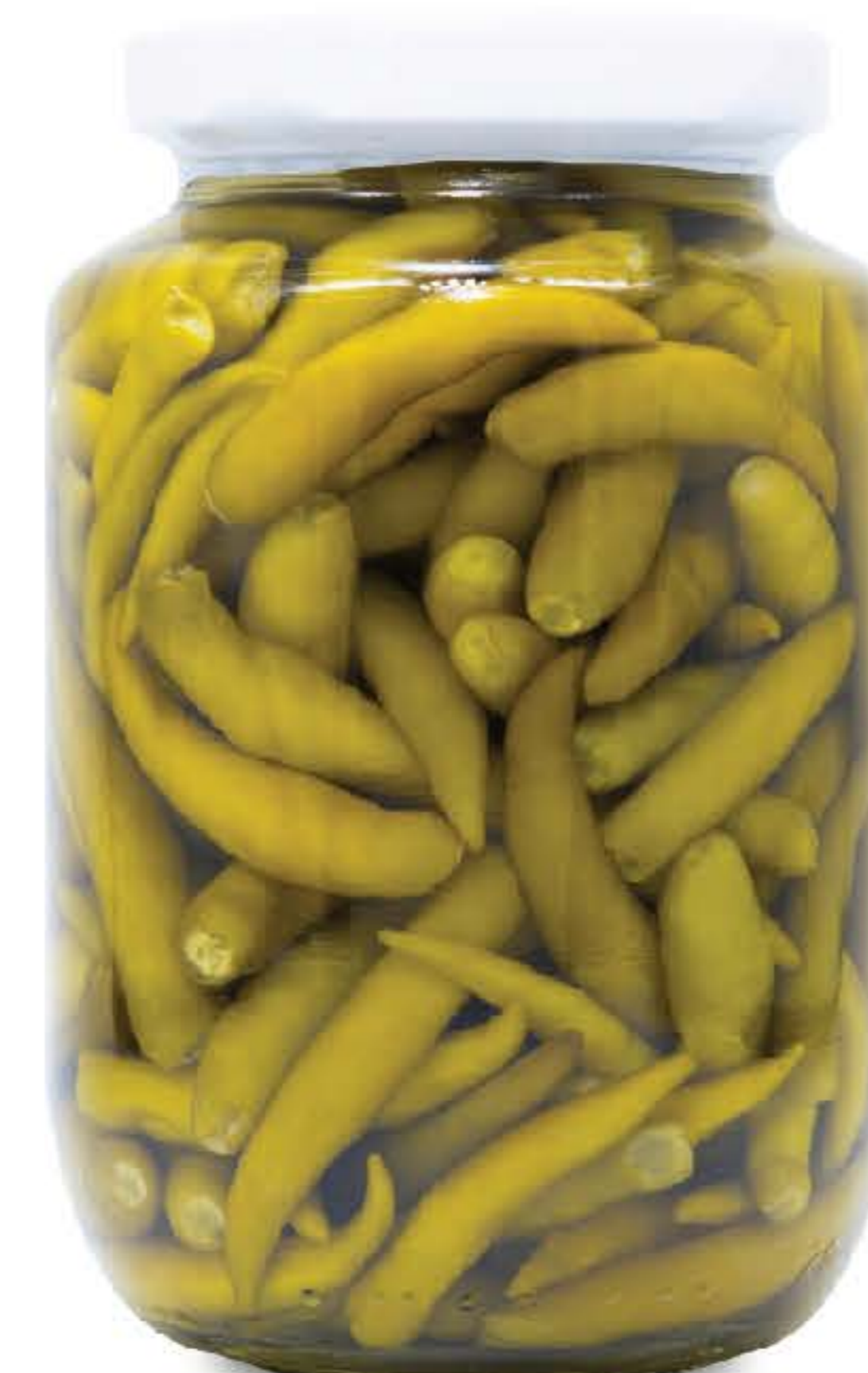
PICKLED GREEN CHILI IN BRINE BYSRI BRAND