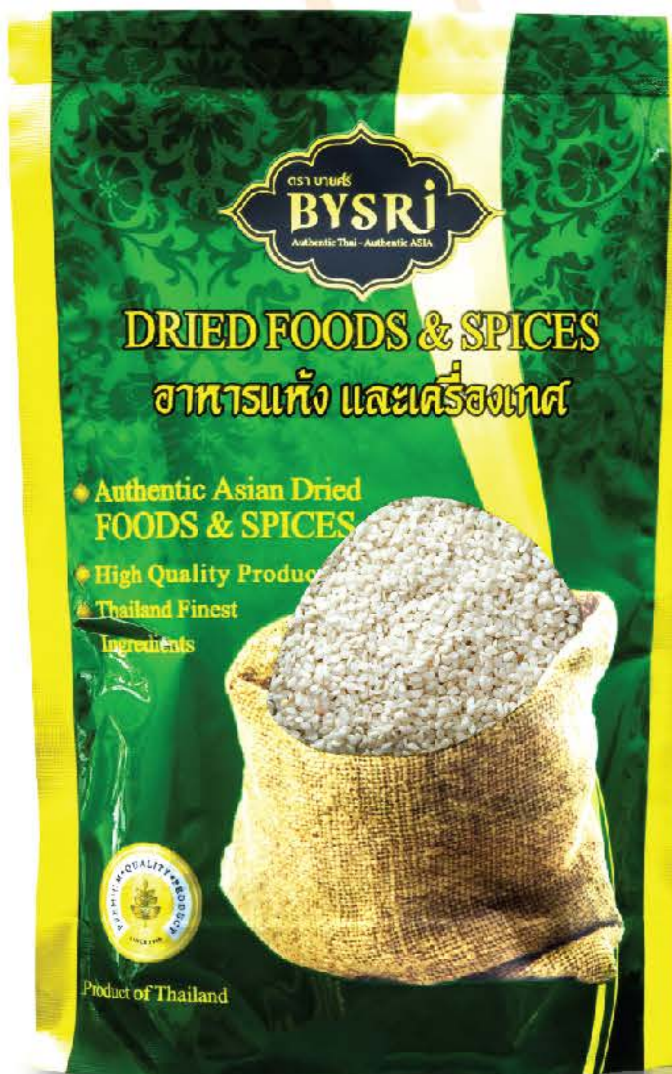
WHITE SESAME BYSRI BRAND