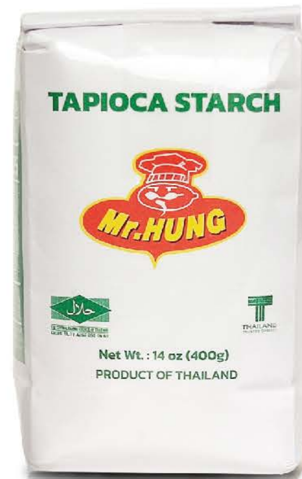
TAPIOCA STARCH MR. HUNG BRAND