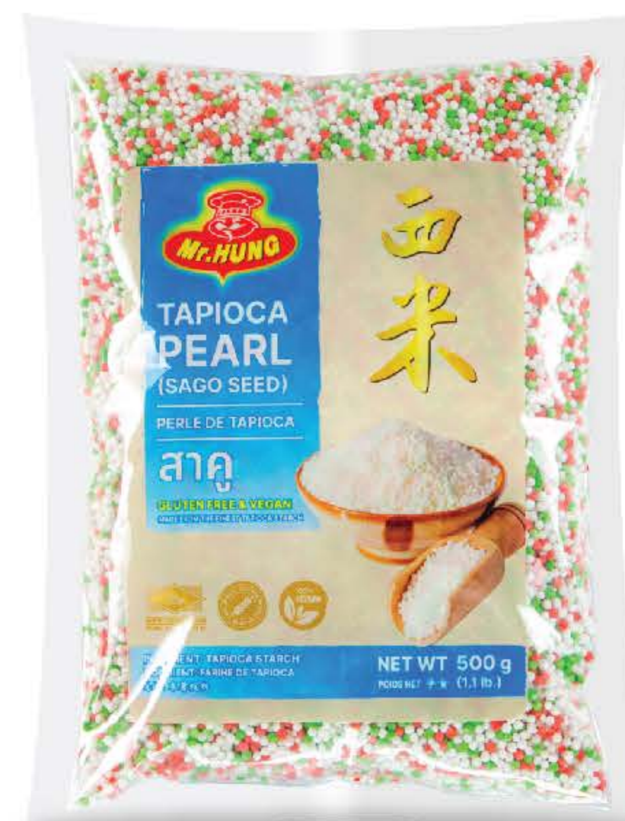
SMALL MIXED SAGO MR. HUNG BRAND