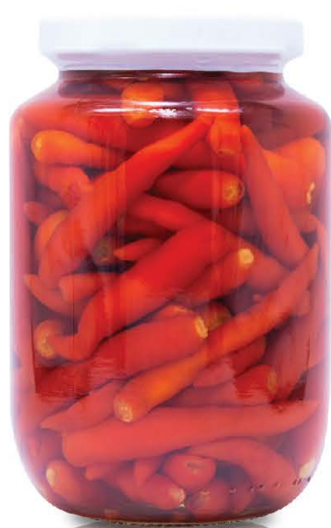
PICKLED RED CHILI IN BRINE BYSRI BRAND