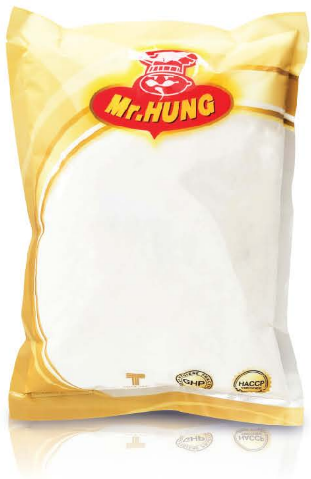
GLUTINOUS RICE FLOUR MR. HUNG BRAND