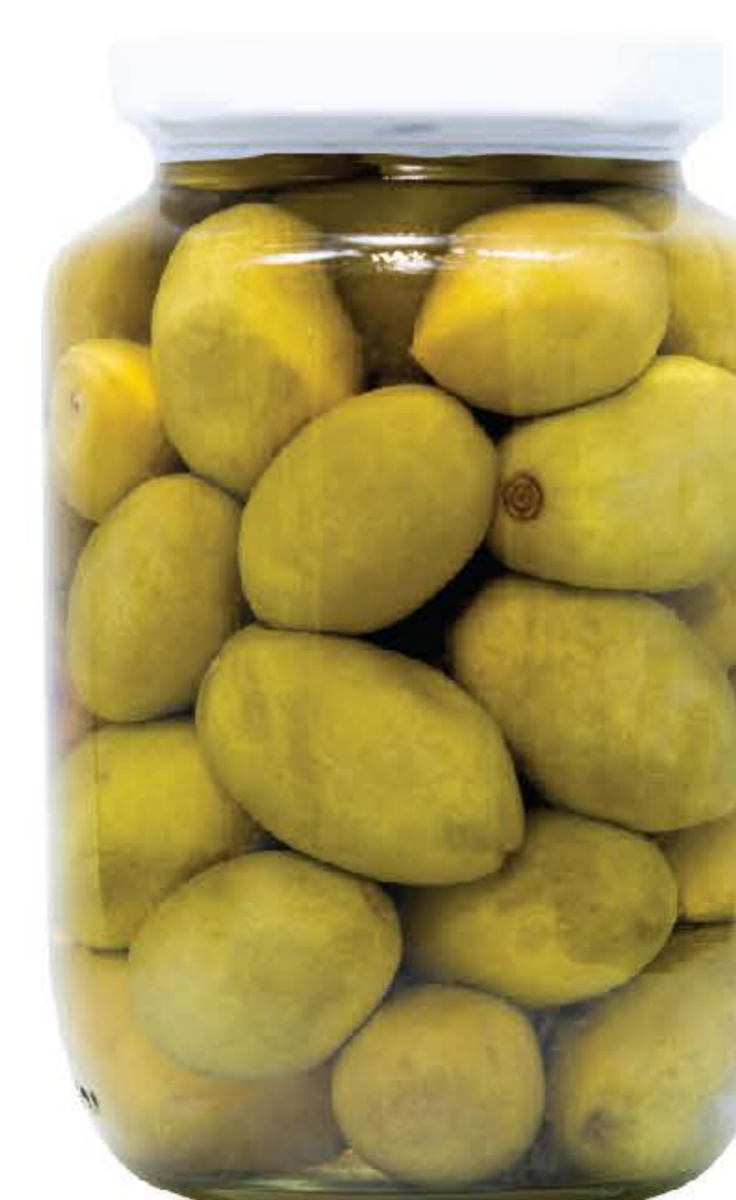
PICKLED THAI OLIVES IN BRINE BYSRI BRAND