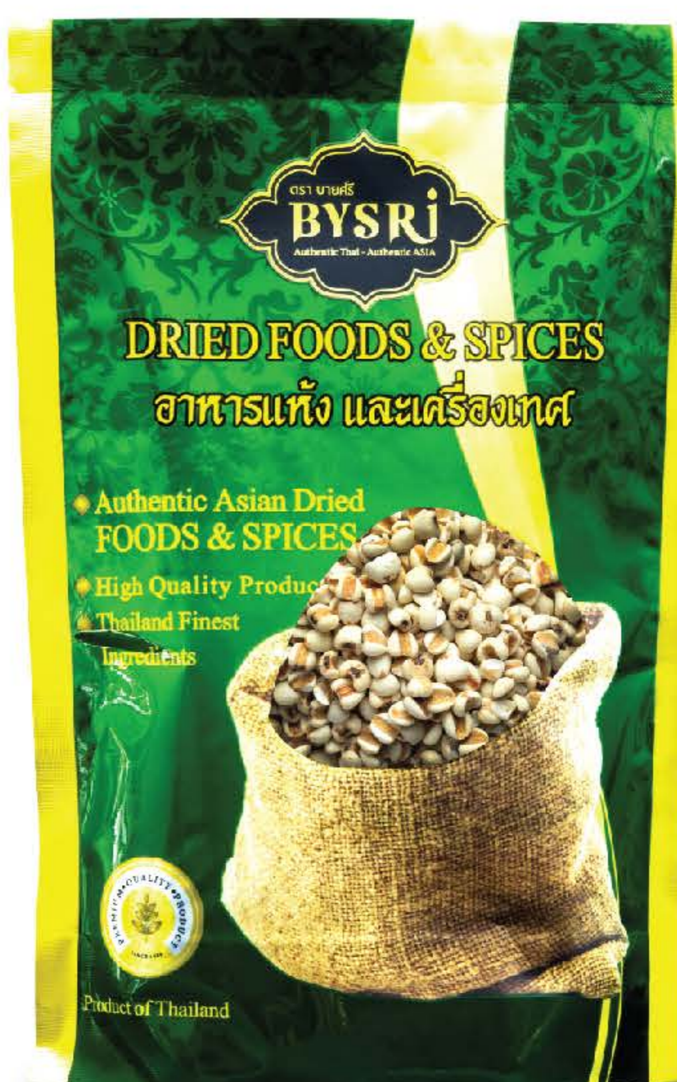
JOB'S TEAR BYSRI BRAND