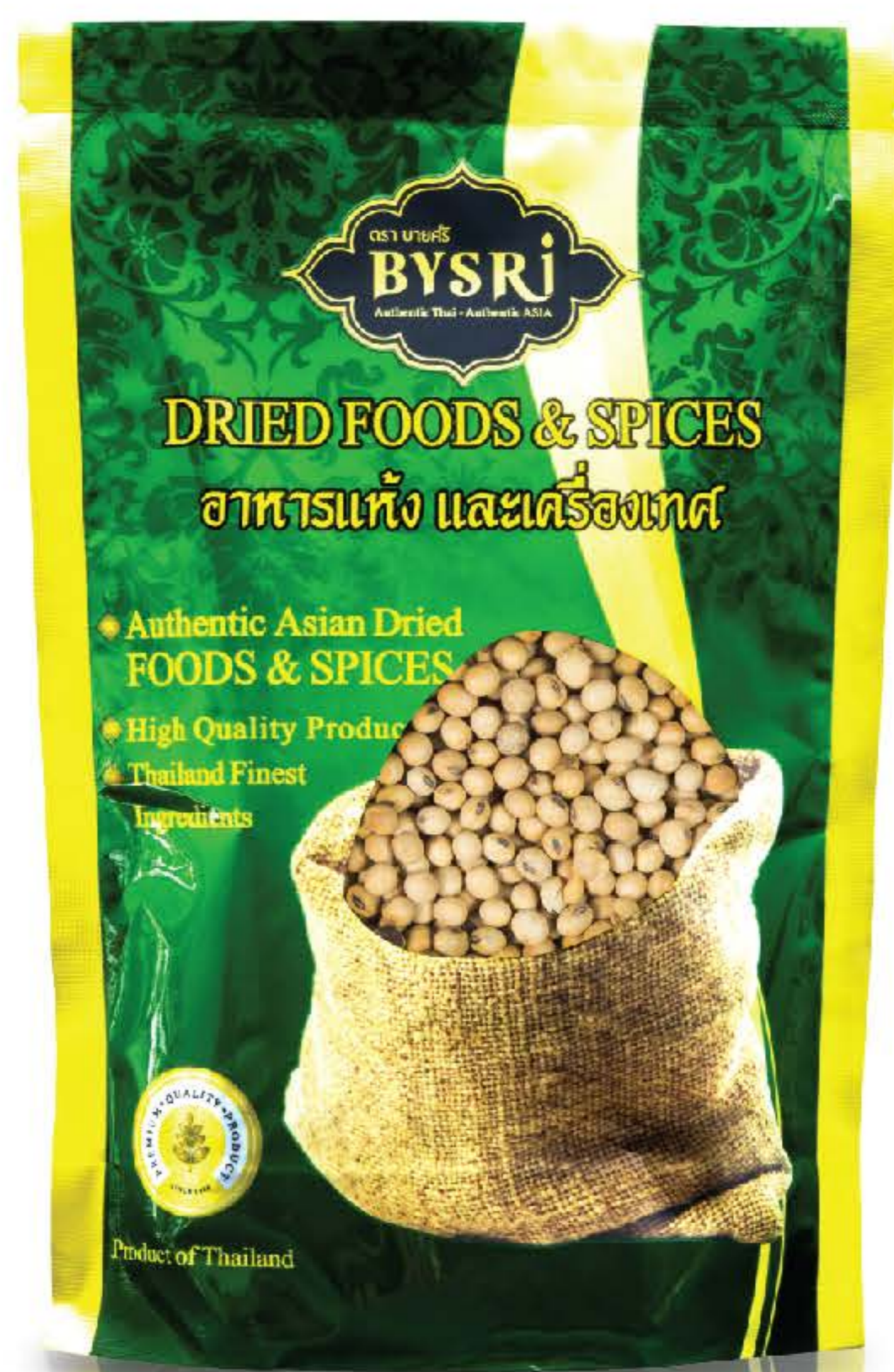
SOY BEAN BYSRI BRAND