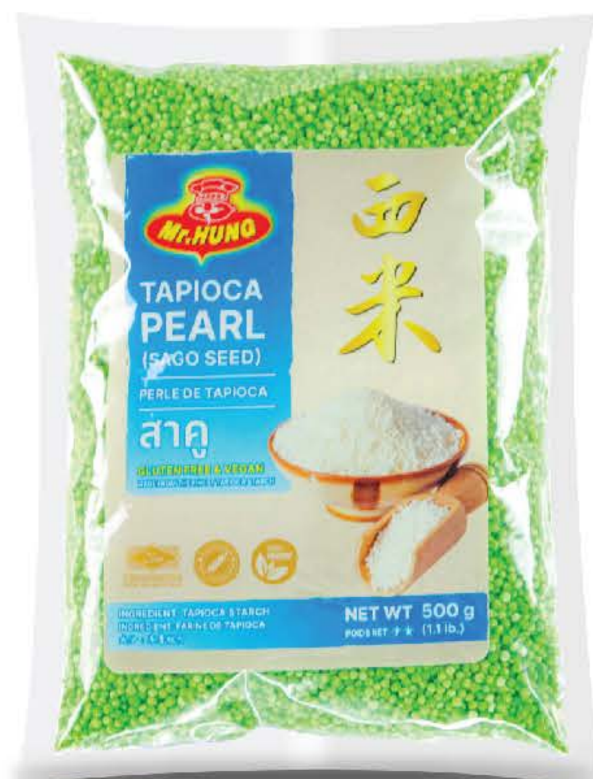
SMALL GREEN SAGO MR. HUNG BRAND