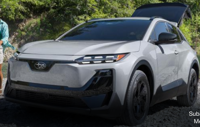
Subaru Uncharted Sport in Metropolis Gray Metallic.

Explore additional features, photos, and awards.