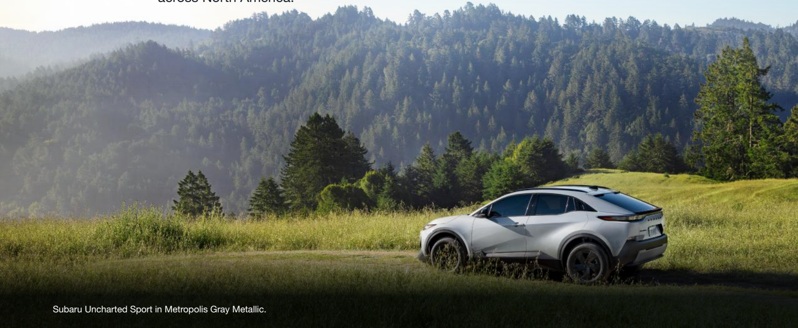
Subaru Uncharted Sport in Metropolis Gray Metallic.

Explore without limits—enjoy easy access to more than 25,000 Tesla Superchargers across North America.