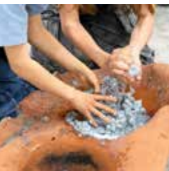
Chrysalis and Butterfly , Workshop view, Optica Montreal, Lelisure 2025.