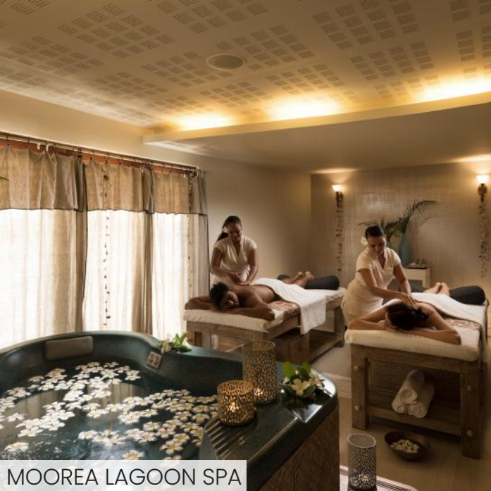
MOOREA LAGOON SPA