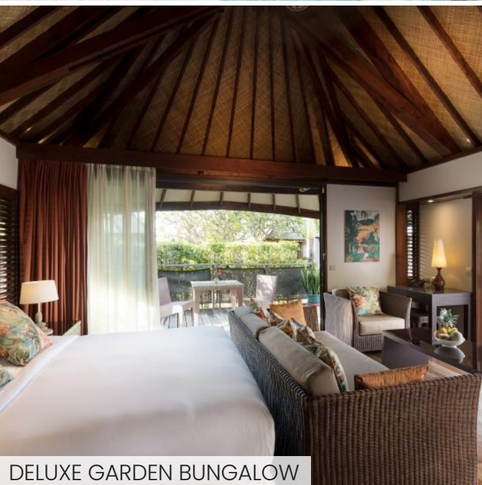
DELUXE GARDEN BUNGALOW

Hilton Moorea Lagoon Resort and Spa offers a variety of accommodations for your French Polynesian getaway. Whether you're on a trip with the family or on a romantic couple's escape, there is a space made for you to enjoy the best of the island.