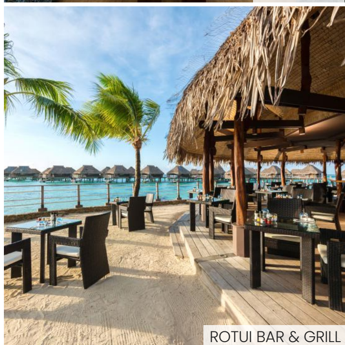
ROTUI BAR & GRILL