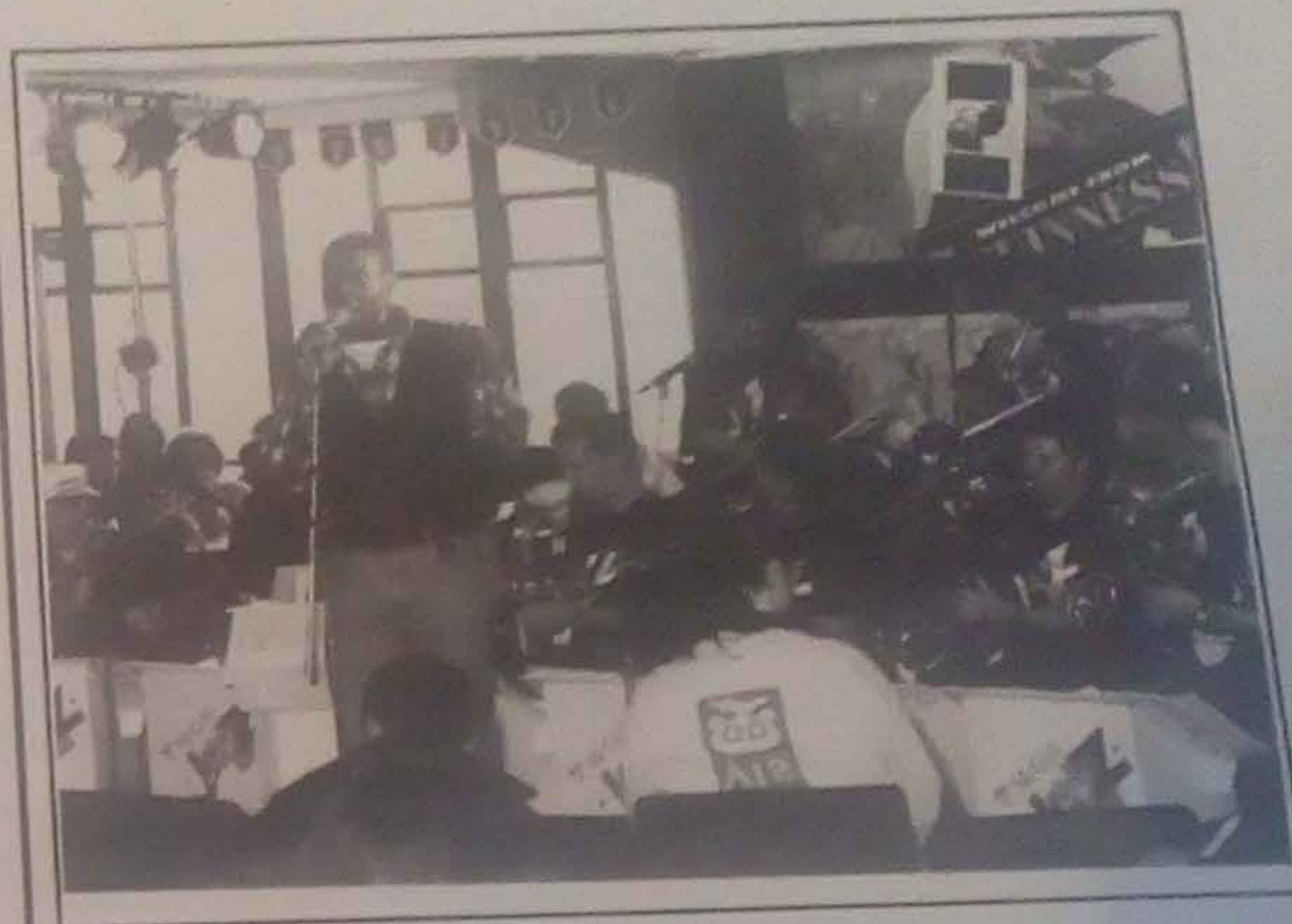
McGill Jazz Band - Canteen Concert