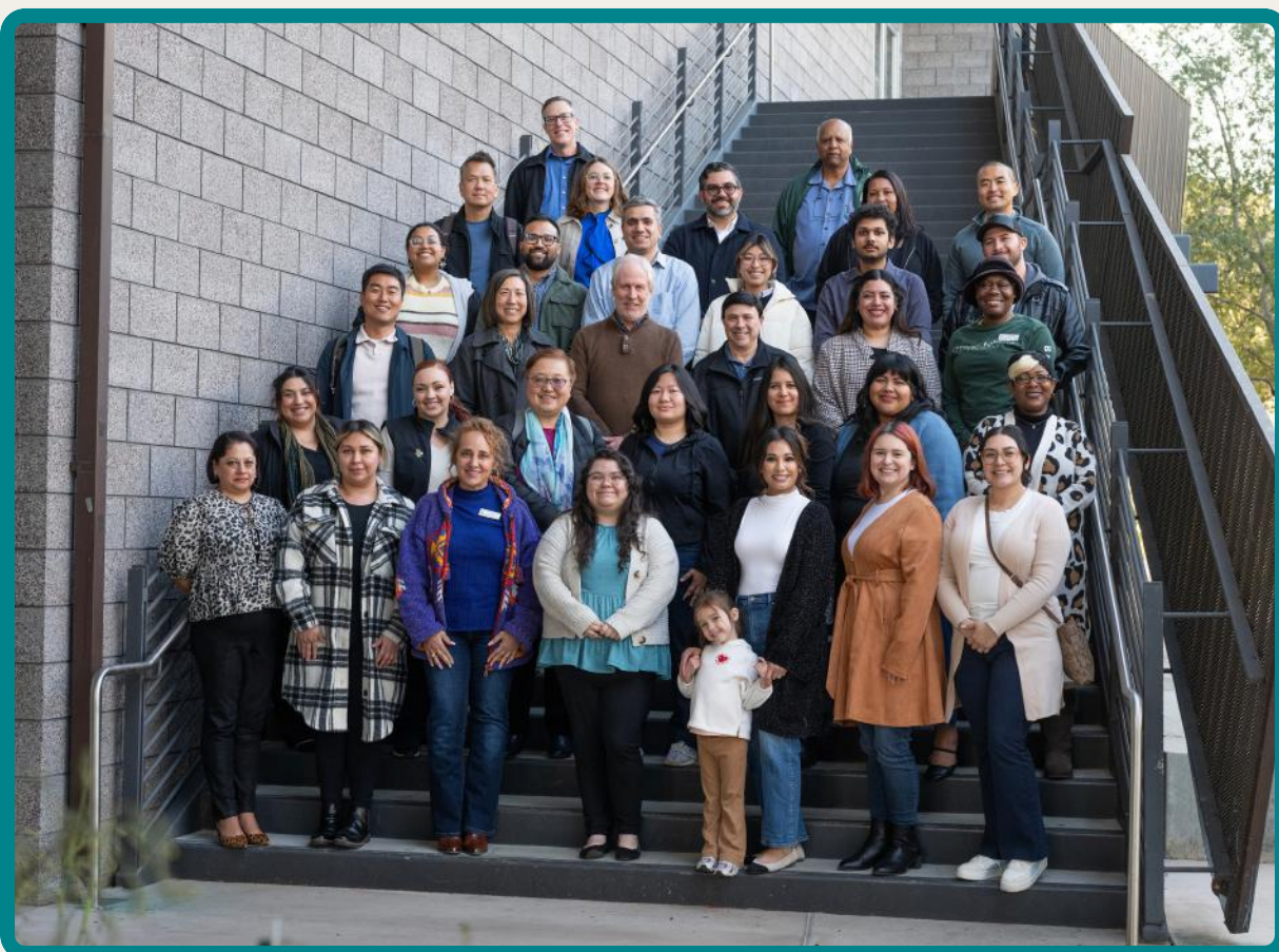
Winter 2025 Attendees Group photo.