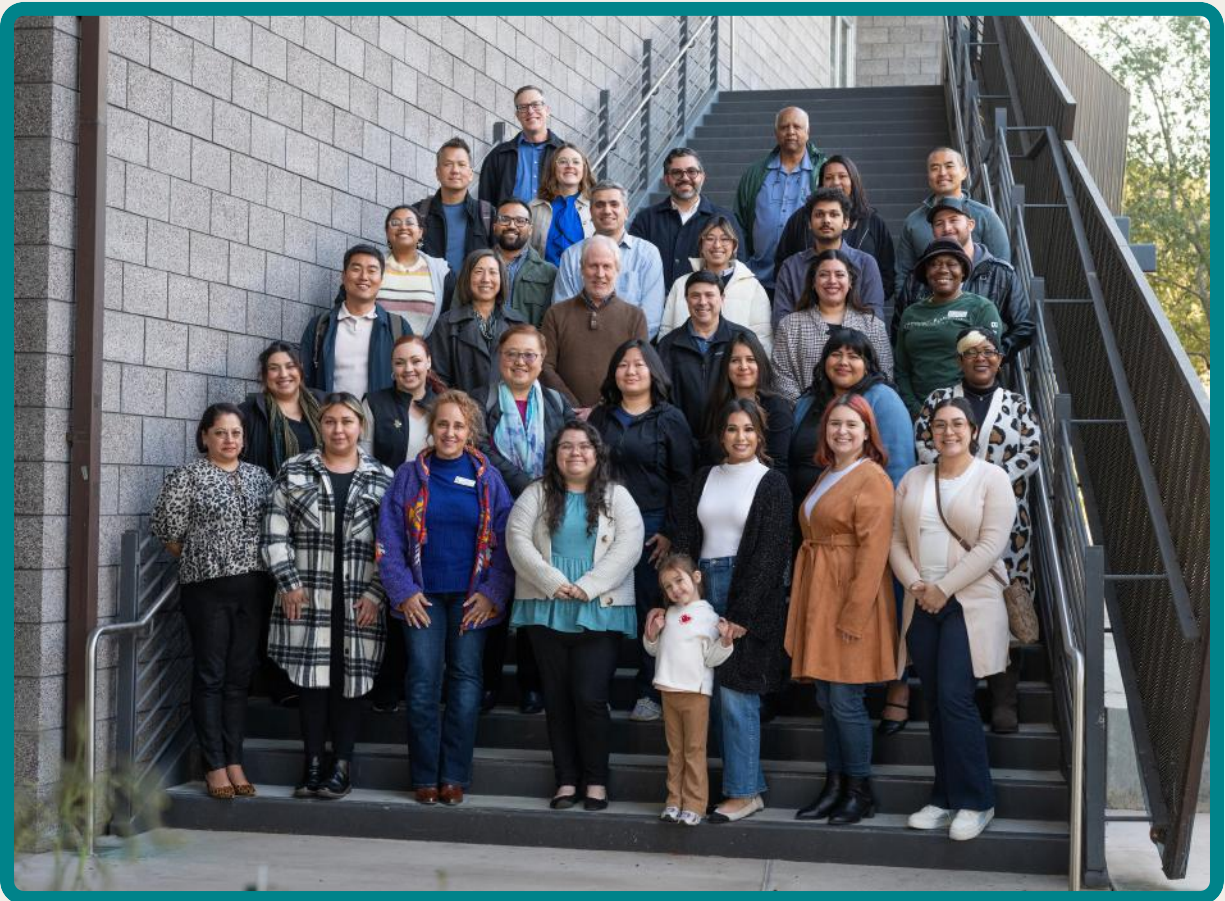
Winter 2025 Attendees Group photo.