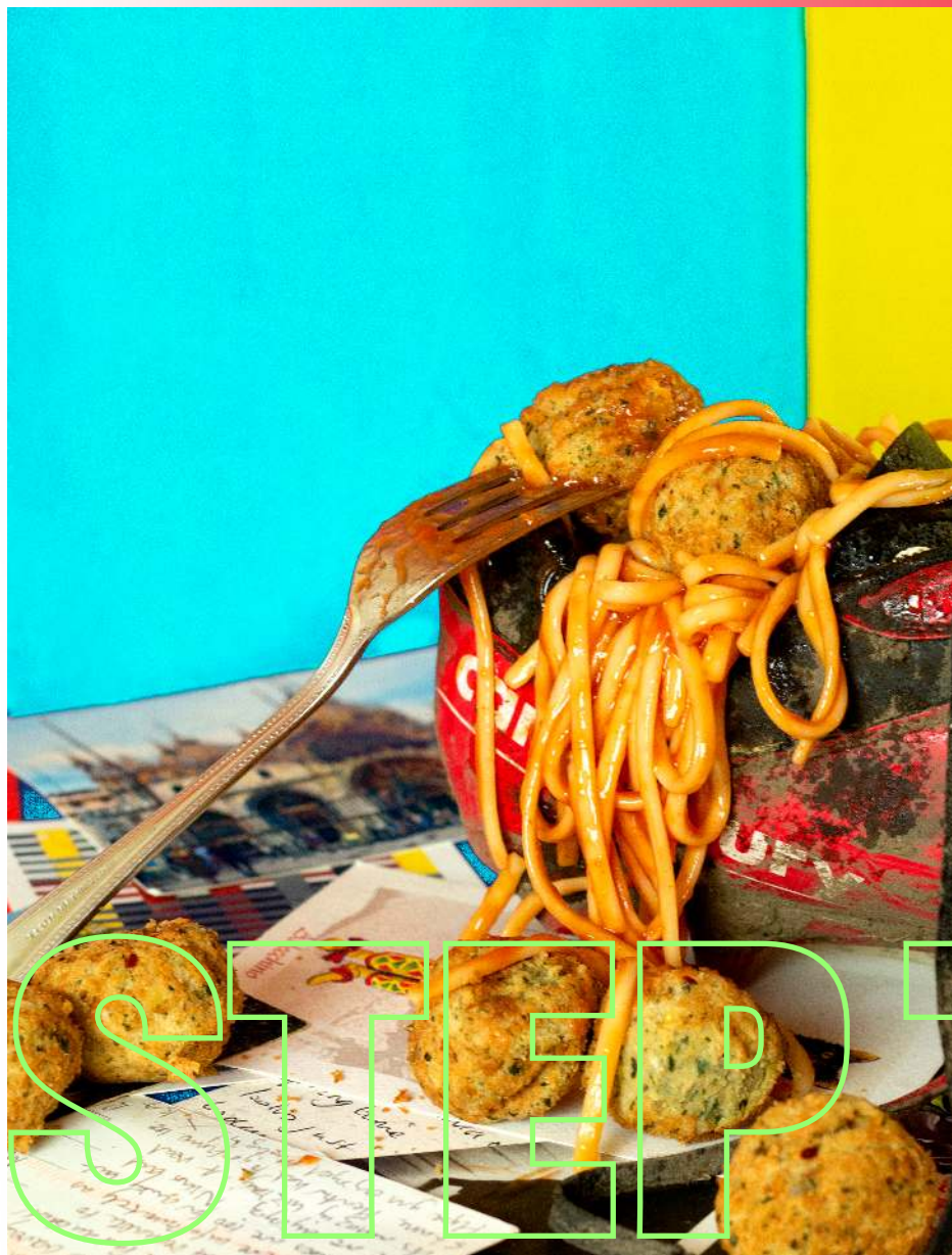
BALLS SAUCE CARBS