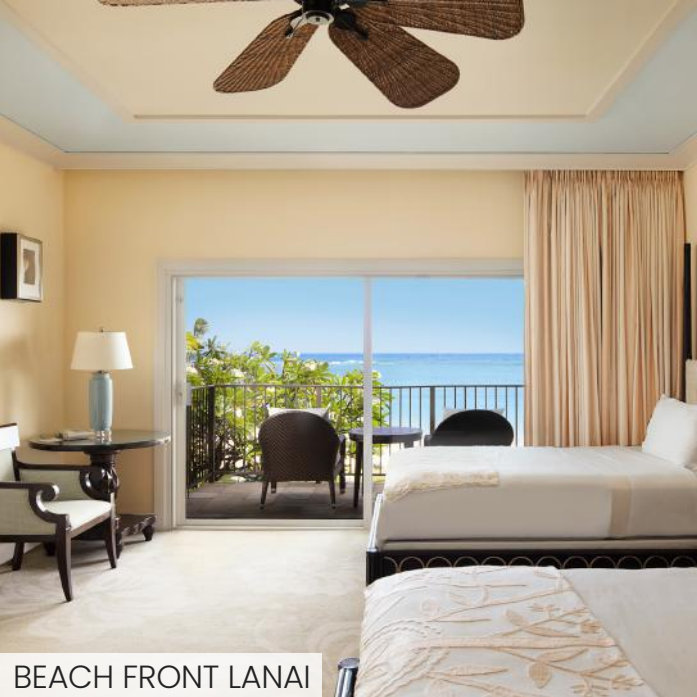
BEACH FRONT LANAI