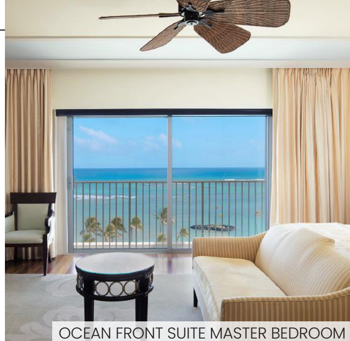
OCEAN FRONT SUITE MASTER BEDROOM

Complimentary amenities are included with each room or suite category with no resort fee. Receive the Aloha lei greeting upon arrival, use the shuttle bus service to explore three landmarks, bask in personalized concierge services, enjoy access to CHI Health & Fitness Center, and much more.