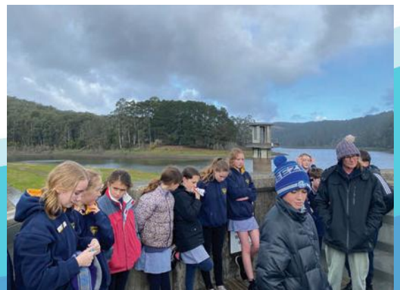
West Barwon Reservoir