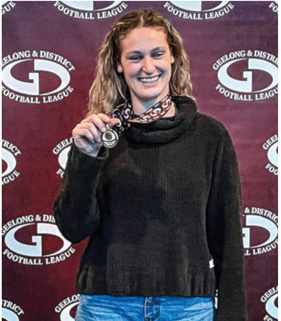
Geelong and District Football League

Despite initially hoping for finals berth due to other teams' losses in the home-and-away season during