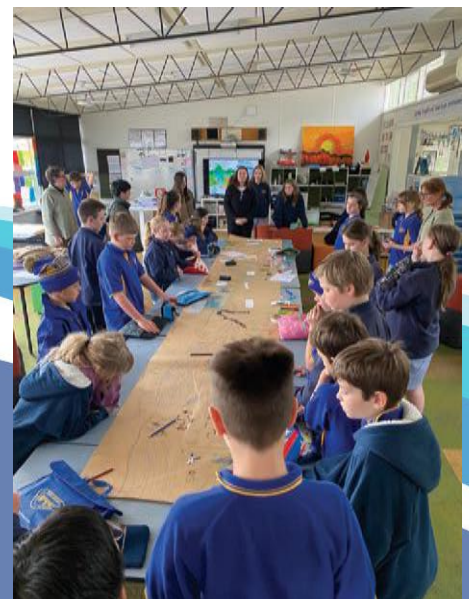
Making the mural on the last day