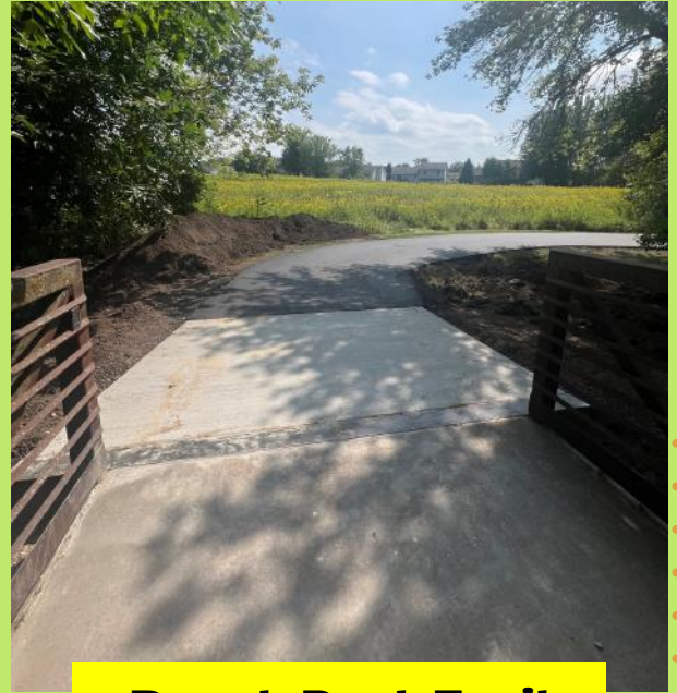
Rusch Park Trail