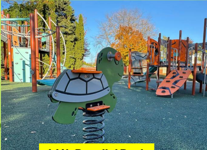
44th Parallel Park