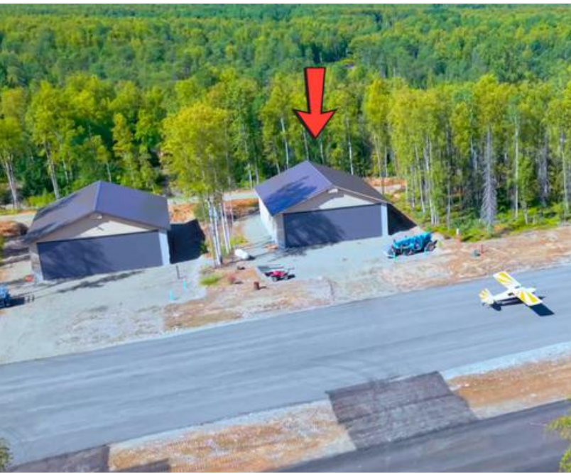
Runway front facing hangar #7