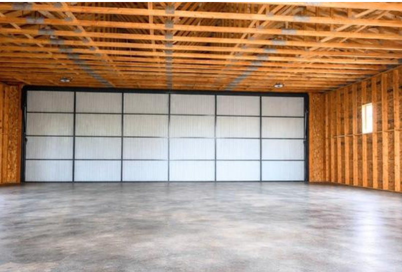
Interior shown as-is with electrical and heating in place