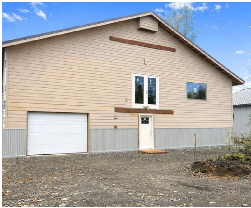
Deck location ready for customization