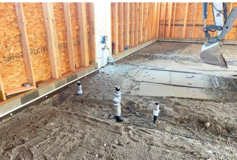
Concrete footing and perimeter wall foundation with a finished 5" rebar-reinforced slab