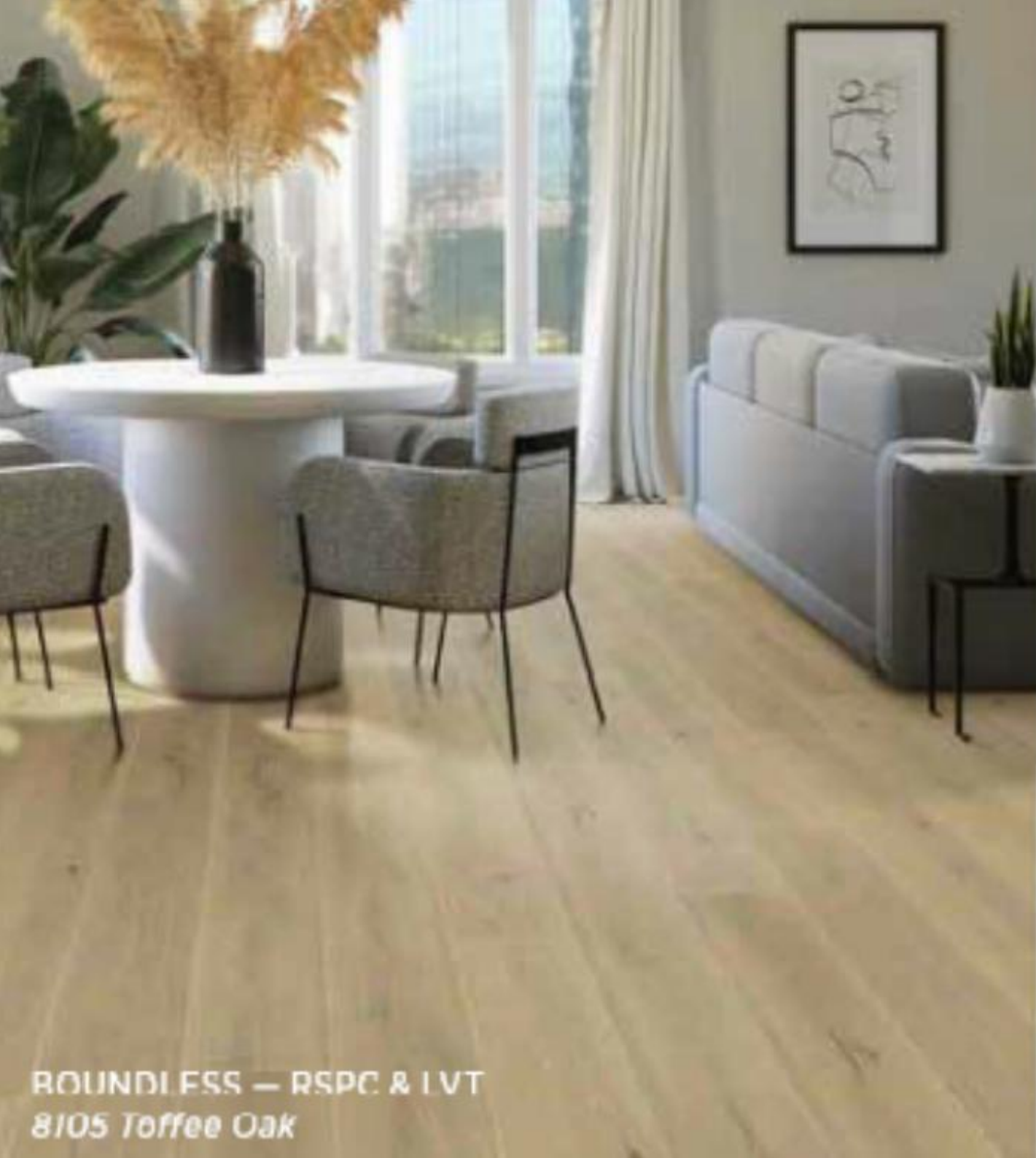
ROUNDLESS — RSPC & LVT 8105 Toffee Oak