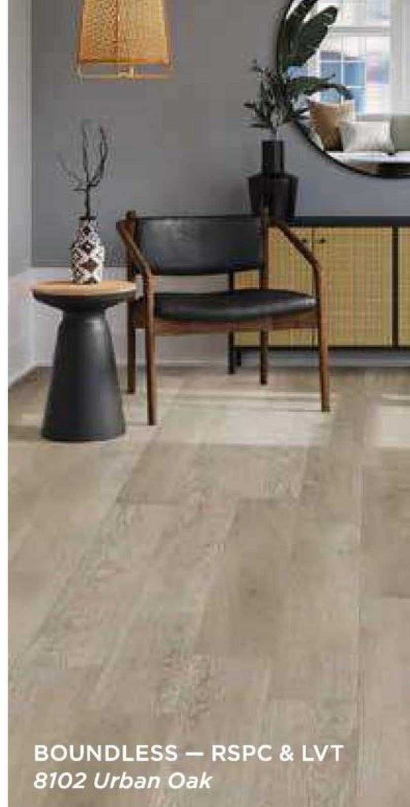
BOUNDLESS — RSPC & LVT 8102 Urban Oak