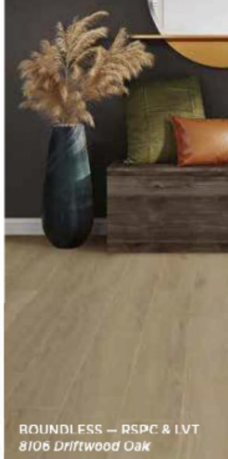
ROUNDLESS — RSPC & LVT 8106 Driftwood Oak