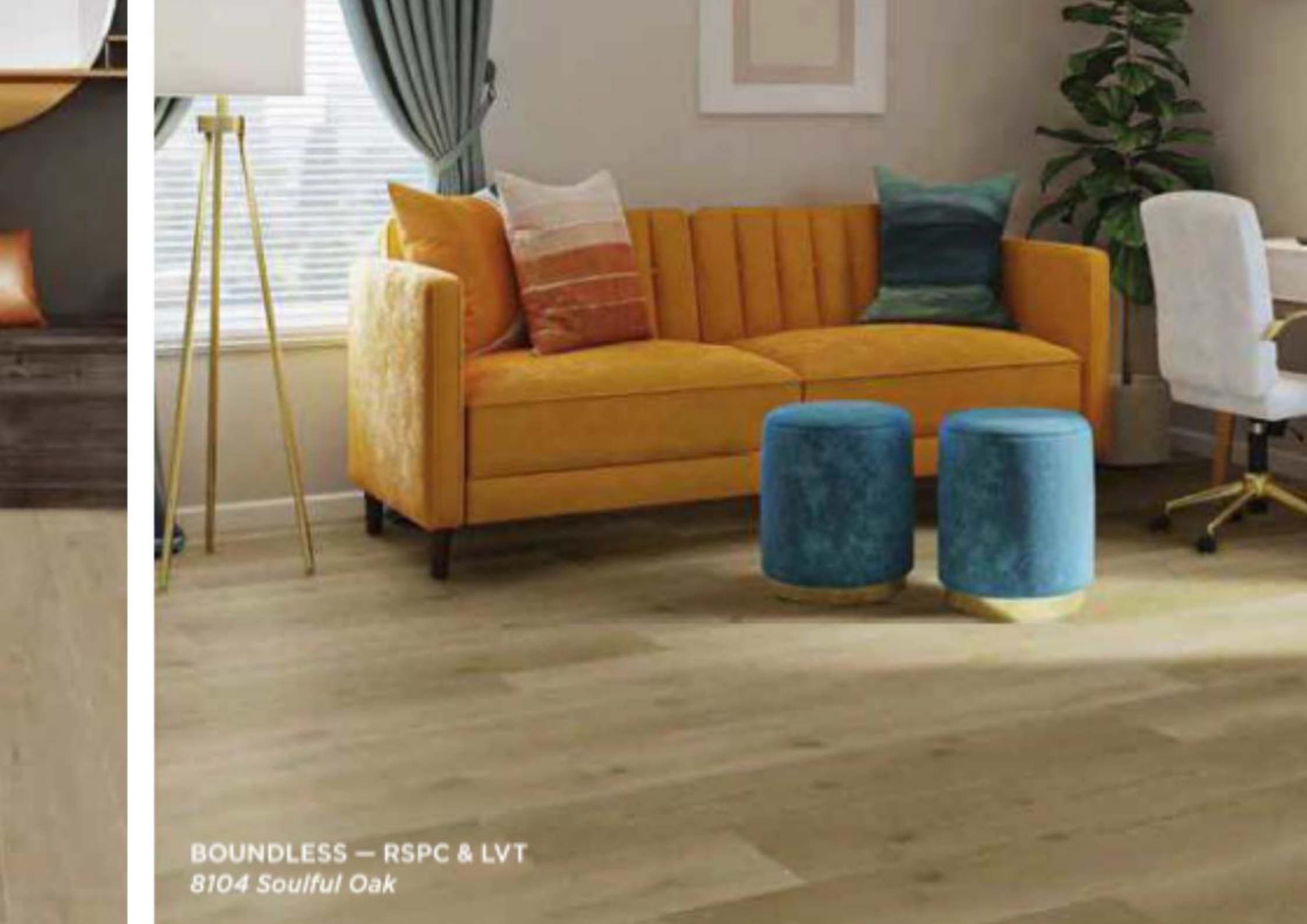
BOUNDLESS — RSPC & LVT 8104 Soulful Oak