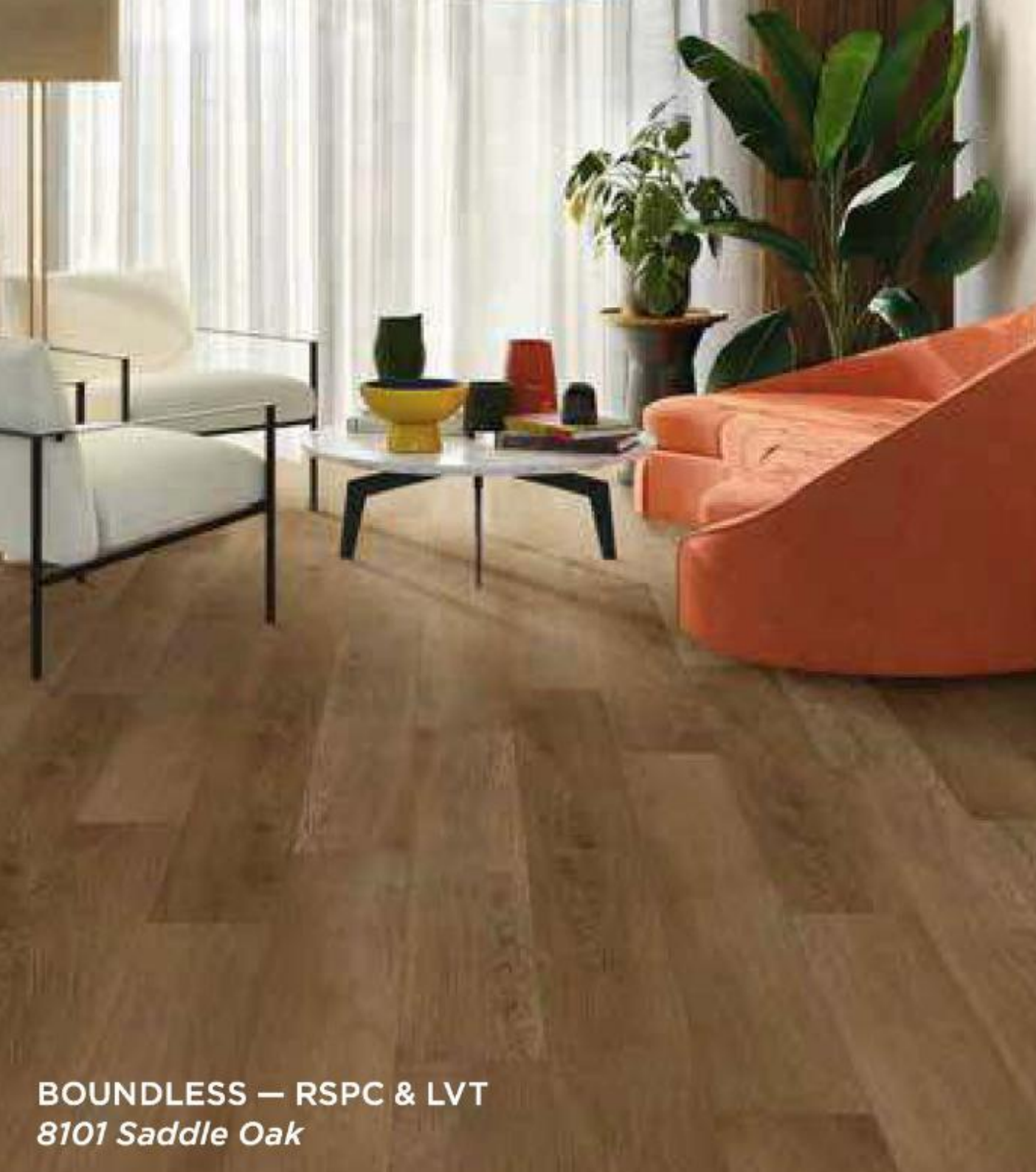
BOUNDLESS — RSPC & LVT 8101 Saddle Oak