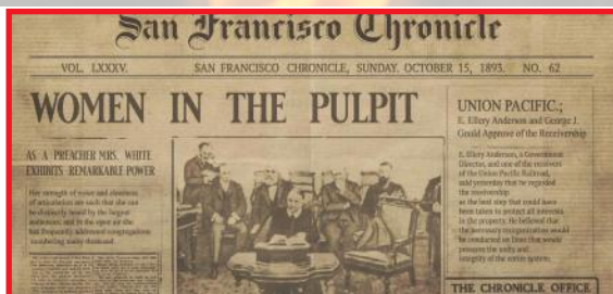
A newspaper article about Ellen G. White preaching in October 1893

The second focus of Ellen White's life was the Bible. The Bible played a foundational role in her personal experience and in her ministry. Her writings are full of Scripture. Her prophetic ministry was to uplift the Word of God. Mrs. White wrote, "You are not familiar with the Scriptures. If you had made God's word your study, with a desire to reach the Bible standard and attain to Christian perfection, you would not have needed the testimonies. It is because you have neglected to acquaint yourselves with God's inspired Book that He has sought to reach you by simple direct testimonies...The written testimonies are not to give a new light, but to impress vividly upon the heart the truths of inspiration already revealed." She also wrote this, "Let all prove their positions from the Scriptures and substantiate every point they claim as truth from the revealed Word of God..." Testimonies for the Church 2, 605; Evangelism, 256 In her last message to the entire Seventh-day Adventist Church at the General Conference Session in 1909 she held up her Bible and stated, "Brethren and sisters, I commend unto you this Book."