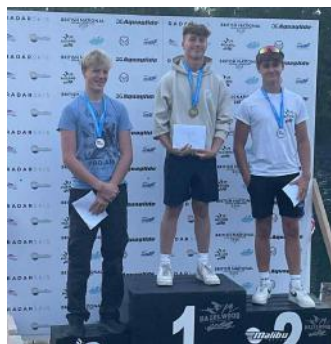
Withers on water skiing podium

'Our football shirt company customises shirts from both current and retro kits as shown on our website. Some customers specify other specific shirts to customised or even send us one that they own. I started out customising my own shirts six months ago and began selling when I felt that my designs were of a high enough standard. I funded the start-up by selling my old clothes and using some savings. I generally use Photoshop for my designs and aim for a