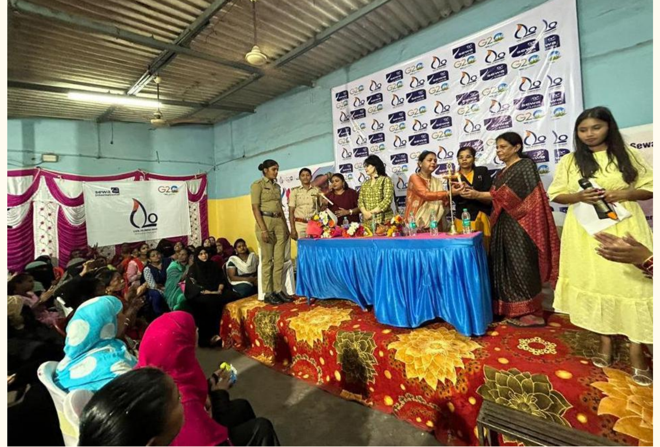
SHE Team Launches Skill and Livelihood Training Program in Bengaluru, Karnataka, India

The SHE team's goal is to provide skill and livelihood opportunity training to 3,000 women across 15 states through its Covid Affected Families (SHE-CAF) program. In phase one, the program trained 1,121 women. Phase 2, which is currently underway, plans to teach 2,651 women bringing the total to 3,772.