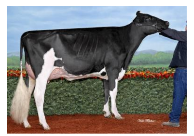
Blondin Unstopabull Cheers VG-86-2YR

BLONDIN UNSTOPABULL CHEERS VG-86-2YR Pedigree