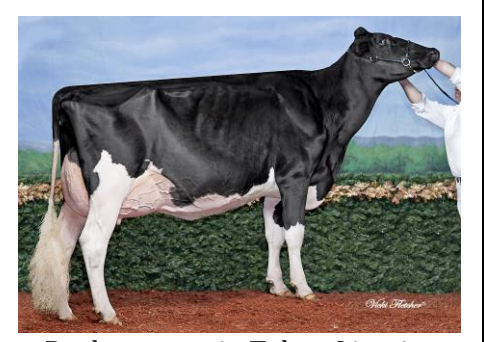
Rockymountain Talent Licorice EX-95-8*

2 #1 – Blondin Energy ( Sexed semen ) + Blondin Destination ( Sexed semen ) at $800 CAN per embryo