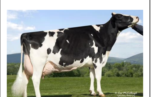
Windy-Knoll-View Pledge EX-95-3E 3*