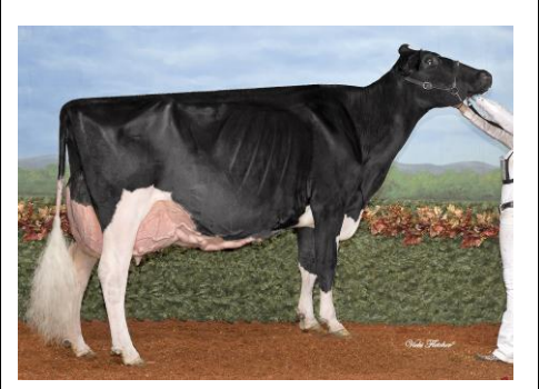
Jacobs Jordan Carmel EX-94-2E 1*

At 3-05, Danae produced 11,002kg 4.7%F 3.5%P (233-299-257). She has a tremendous pedigree as she goes straight back to Apple herself! Her dam is an EX-91-3* Atwood x EX Shottle x EX-94-2E Talent x KHW Regiment Apple EX-96-4E-37*.