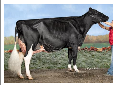
Unique Dempsey Cheers EX-95-3YR-MAX-USA (Dam)

Unique opportunity to make your own CHEERS!