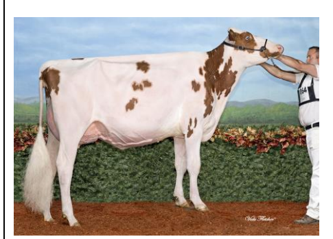
Blondin Avalanche Darleen VG-89-3YR (MAX)