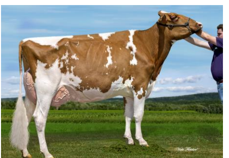
Blondin Avalanche Lovelyn VG-89-3YR-MAX