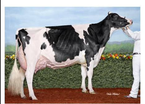
Pierstein Windbrook Alacazam EX-94