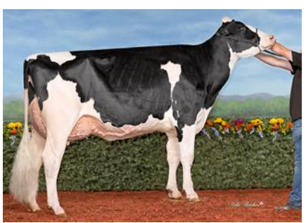
Blondin Unstobull Cheerios VG-89-3Yr (Max)

CHEERS was RESERVE INTERMEDIATE CHAMPION in 2018 at the World Dairy Expo. The previous year, in 2017, she went in and placed 2^{nd} in the Jr 2Y Old at that same prestigious show.