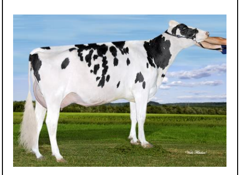
Crasdale DM Hunter EX-91 1*

At 7 years old, she is still +9 Conformation and 2773 GLPI and she loves to work. She produced 12,917kg of milk at 4-2 with 5.4%F and 4.0%P (248-363-314). Talk about components!!