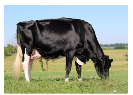
Unique Dempsey Cheers EX-95-3Y-MAX-USA