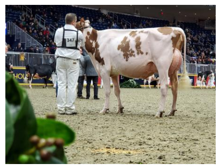
2nd Milking Yearling B&W Royal Winter Fair 2019

BLONDIN AVALANCHE DANAE-EX-93-4YR Pedigree