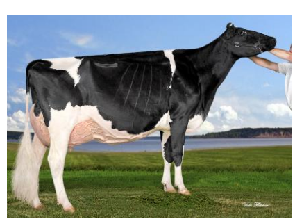
Pierstein Cicero Time Out EX-95 1*

Divou was 8<sup>th</sup> milking yearling at the Royal Winter Fair in 2017 and she comes directly from the family of the great Mabel Astre Piva EX-3E-4*.