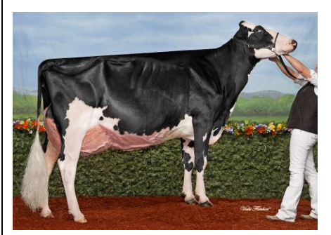
Winterbay Fever Legacy EX-96-3E 6*

BLONDIN DOORMAN LEGEND VG-87-3YR Pedigree