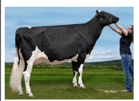
Blondin Doorman Legend VG-87-3YR