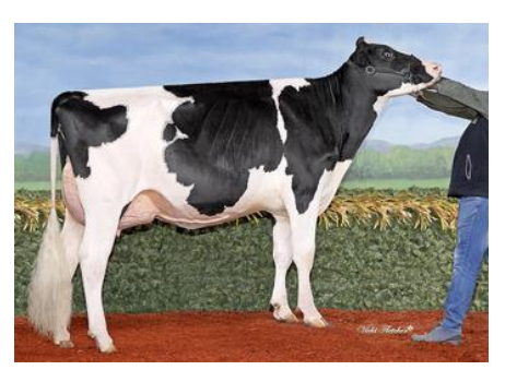
Drewholme Lambda Leysure-P VG-87-2YR

From the powerful Pala, Promis and Pledge cow family, Paige is backed by 6 EX dams in a row back to the great Windy-Knoll-View Pledge-EX-95-3E-3* and then Windy-Knoll-View Promis-EX-95-2E-4*. A pedigree filled with incredible high scoring cows!