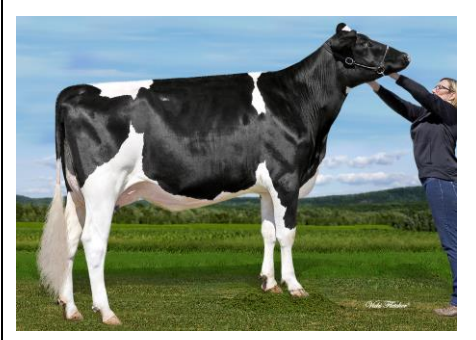
Jacobs Impression Timbery VG-87-3YR

Timbery is a direct daughter of Pierstein Cicero Time Out EX-95 sold for 250,000$ in the best of Jacobs sale in 2019. Time Out is well known in the showring, she was 2^{nd} Mature Cow at the 2022 World Dairy Expo and then Nominated All-American after being named Reserve All-Canadian in 2017 and Grand Champion at the Trois-Rivières show in 2017 and 2019. Her 2^{nd} dam is also used to the show ring. In fact, Pineland Goldwyn Tidbit was 2^{nd} Sr 3Y Old at the World Dairy Expo and 1^{st} Sr 3Y Old and Reserve Intermediate Champion at the Royal Winter Fair the same year. She also went on to be All-Canadian and Reserve All-American the same year.