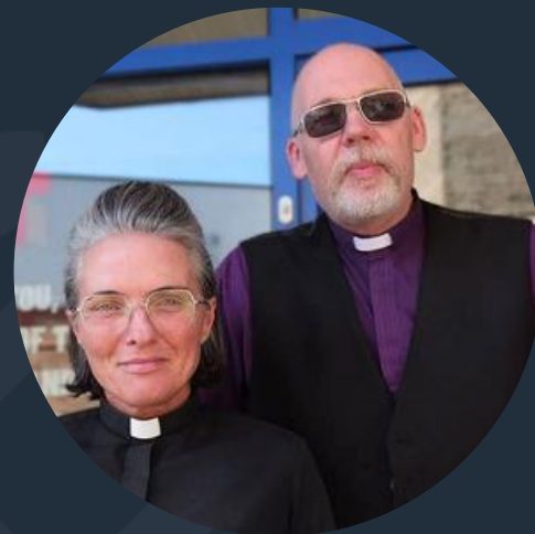
As seen on National TV, Radio and in the press